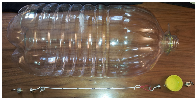
Fig. 1 A container was filled with water at body temperature (36 °C). Stents were fixed with clips at both ends and spanned throughout the phantom model for measurements

Results are demonstrated in Fig. 2a. All polyurethane-based stents showed a blue appearance on DECT, whereas stents composed of silicone were red. The assigned colours were constant over various kVp values. The determined colour according to material composition of various stents from the same manufacturer was consistent throughout our measurements (Table 1). As shown in Fig. 2b, placing a pure calcium oxalate monohydrate stone (blue) of 2 mm in size next to a ureteral stent of blue colour makes it difficult to discern the fragment on both coronal and sagittal reformatted DECT