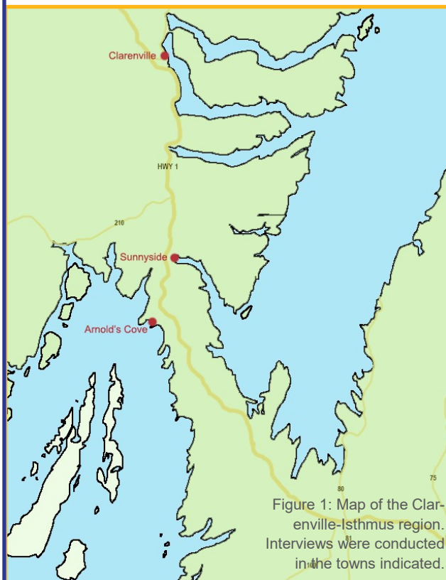
Figure 1: Map of the Clarenville-Isthmus region. Interviews were conducted in the towns indicated.

Results from the Community Impacts component are based on 182 semi-structured interviews conducted with key informants and stakeholders across Newfoundland and Labrador from 2012 to 2018. 25 interviews were conducted with stakeholders in the Clarenville-Isthmus region.