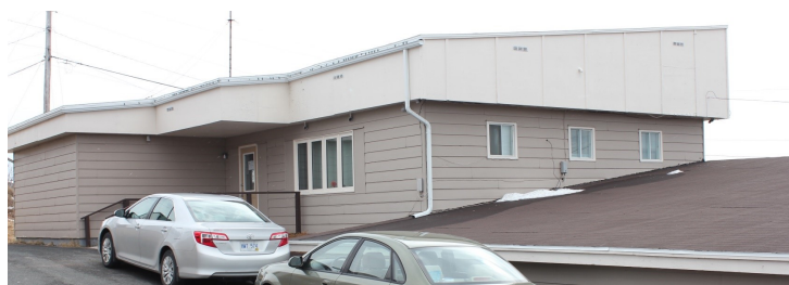
Figure 2: Municipal Building in Sunnyside

A lack of inter-community cooperation in the region was felt to have prevented regional decision-making and cooperation among communities addressing the impacts of resource projects. Though communities did meet to discuss opportunities for regionalization, it was felt that actual sharing of services was not being pursued. Recently, however, communities including Come By Chance, Arnold's Cove, and Southern Harbour have come together to try and establish an Isthmus Regional Development building, to service new businesses, and are willing to work together even though all communities will not be able to contribute equally financially. They feel that they need an industrial partner to fund part of the project but have been unable to secure this funding so far.