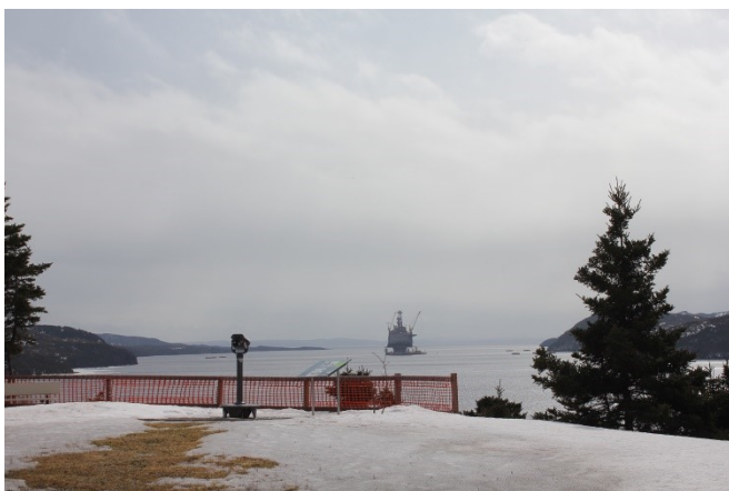
Figure 3: View of Bull Arm from Sunnyside NL.

Sunnyside has developed policies to prevent workers living in trailers. Two RV parks were also developed to address this challenge, allowing the Town to charge water/sewer fees to trailer park operators. One has since closed due to lack of demand. The Town has approached the RCMP about drug-related challenges and traffic signs were being developed to address safety concerns. Sunnyside negotiated to receive recyclable wood from Bull Arm that is sorted and sold to community members as building supplies/firewood for $25 a pick-up truck load. This money, in addition to a grant in lieu of taxes from Hebron, has been put into a legacy fund that they hope will fund a new community building/recreation centre.