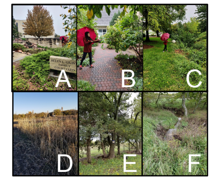
Fig 1. Sampling habitats: A) Johnson Cancer Center; B) Jardine Garden; C) Campus Creek; D) Oat plants; E) Evergeen Plants; F) Big Creek

Each habitat was sampled over three different days, and weather conditions were recorded. Sampling consisted of 20 sweeps of the vegetation with a sweep net (Fig. 1B, 40 cm diameter) on each of three dates. Samples were collected into Ziploc bags, returned to the laboratory, and all collected arthropods were classified into morphospecies (Obrist and Duelli 2010), and counted. We used a Simpson's Biodiversity Index (Ecological Sampling, Magurran and McGill 2011) to characterize the biodiversity for each location and date.