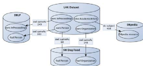
Fig. 2 : Links in the LAK Dataset 28

The following Figure 2 depicts the links of resolved or enriched LAK entities.