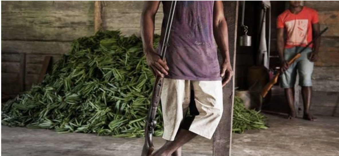
20 21 22 Armed guards watch over a vanilla harvest in Bemalamatra municipality, Madagascar

23 24 25 Figure 3: Photo from Ft article of executives from Mars Inc. who have come to Madagascar on their first trip ever to plan development initiatives in order to stabilize farmers' livelihoods and the market