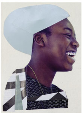
Figure 1 Lubaina Himid, Fill New Buckets with Your Laughter, 2011–12. Acrylic on paper.

The authors explore the metaphorical resonance of making relationships between flexible lines that have the potential to be entangled and enmeshed. As in Carden's account, the fabrication takes place in multiple individual sites, encouraged and promoted through public, private, physical, and virtual spaces. The authors discuss 14 initiatives where textiles brought together diverse populations to reaffirm cultural and social identities through different genealogies and forms of production. Using textile