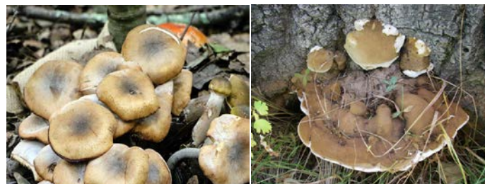
Fig. 3 Fruiting bodies: Armillaria spp (L); Ganoderma applanatum (R)

pruinosa ) was one of the most common and virulent canker diseases found in surveys in both the Intermountain and Rocky Mountain states (Colorado, Idaho, Utah, Wyoming; Guyon and Hoffman 2011, Dudley et al. 2015). This tree disease has no known relationship with environmental stress but needs wounds, typically caused by browsing animals and insects (but human cutting/carving, too!), to become established. In addition, two root diseases are common in aspen stands. Ganoderma root disease ( Ganoderma applanatum ) is largely associated with wind thrown trees in older stands. Armillaria root disease ( Armillaria spp ) is found in pure aspen stands, but is more often associated with aspen stands containing conifers. Neither root disease appears to impact aspen stands after