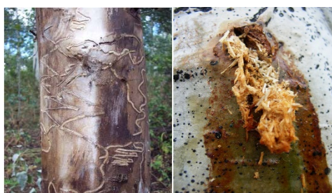
Fig. 4 Wood borers: bronze poplar borer galleries (L); Poplar borer frass (R)

Aspen are commonly affected by a diverse array of pathogens and invertebrates. Forest insects and diseases can drain an aspen clone's carbohydrate reserves, reducing its ability to resist damage or perform other vital functions like growth and regeneration. The first key to managing insects and diseases in aspen forests is recognition of when levels of insect and disease induced dieback diverge from normal background levels. The second key is to avoid regeneration treatments until the impacted aspen forests have recovered.