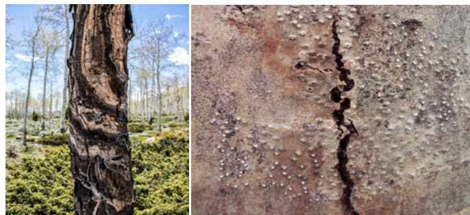
Fig. 2 Concentric rings of sooty bark canker (L); Cytospora canker fruiting bodies (R).

In mature cohorts, sooty bark canker ( Encoelia