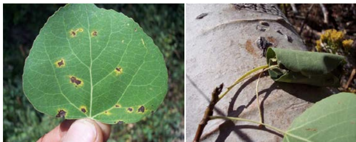
Fig. 1 Defoliators: Marssonina leaf blight (L); leaves rolled by, large aspen tortrix (R)

1) Stressors: In addition to stress caused by drought or ungulate herbivory, outbreaks of defoliation by both insect and disease agents also stress aspen stands. Two of the more common defoliating agents are Marssonina leaf blight ( Marssonina brunnae ) and the large aspen tortrix ( Choristoneura conflictana ). However, multiple consecutive years of repeated defoliation in the same location is usually required before dieback or mortality is triggered.