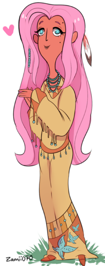
Figure 2 Drawing of Fluttershy reimagined as a Native American by Zamii070 9

I thought like,, fluttershy likes animals and nature and natives are very spiritual and one with nature,,, also fluttershy is very brave and will defend her friends so i gave her a feather i dunno,,,,, i spent like 40 minuets trying to find outfits and info that where from native tribes because all of the pics were from halloween costumes and disney and i duno.. i guess i didnt do a very good job u~u