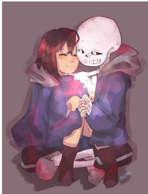
Figure 8 Fanart of Sans x Frisk in which both characters are of an ambiguous age 57