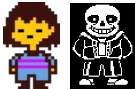
Figure 7 Canon art of Frisk 53 (left) and Sans 54 (right)

This fandom features an interesting case study that shows how internal antagonism reacts to an already-established community boundary, in this case how physical attacks are never okay, even in the context of extreme value offenses such as pedophilia. Rather than investigating and testing boundaries like in the other case studies, internal antagonism was used instead to just reinforce a boundary. In early 2018, Taiwanese Undertale fan artist Avimedes was gifted cookies that contained needles in them from a teenage fan at a convention. The artist only realized the cookies’ contents when she bit into one and pierced her tongue. 52 It’s interesting to note that this attack ostensibly mirrors the classic legend that describes needles placed maliciously in Halloween candy to maim and kill hapless trick-or-treaters. It’s hard to say that the incident was inspired by this legend, but the parallels clearly resonated with English-speaking fans who heard about the attack.