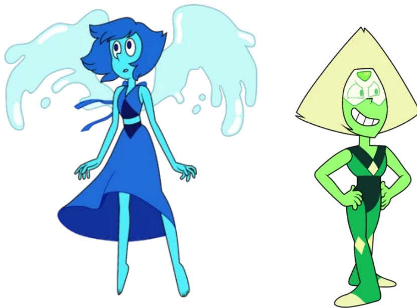
Figure 5 Canon images of Lapis 30 (left) and Peridot 31 (right). Not to scale.

In the context of Jesse Zuke and Steven Universe , the accused queerbaiting happened between two secondary characters, Lapis Lazuli and Peridot. Before delving into the details of this controversy, some understanding of the two characters and their reception by the fandom is important. Both characters, like all gems, present as female. Peridot is a light green and yellow gem and her hair shape has been affectionately