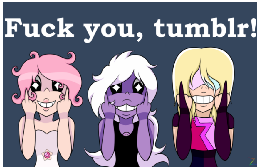
Figure 4 Art of Skinny Rose Quartz, Tall and Skinny Amethyst, and White Garnet 18

To show their loyalty for Zamii against the vocal opposition, the vocal support drew pictures that would be considered problematic to their adversaries. Common trends in these pictures are flipping off the viewer and drawing characters as skinny or