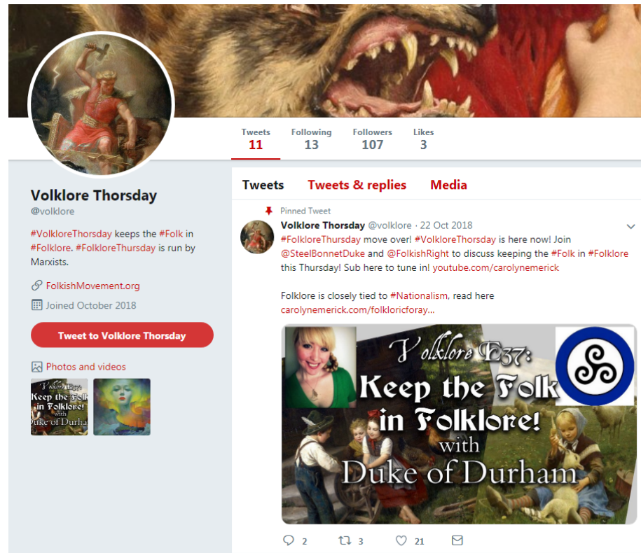
Figure 9 Screenshot of @volklöre, the Twitter page for #VolklöreThursday 67