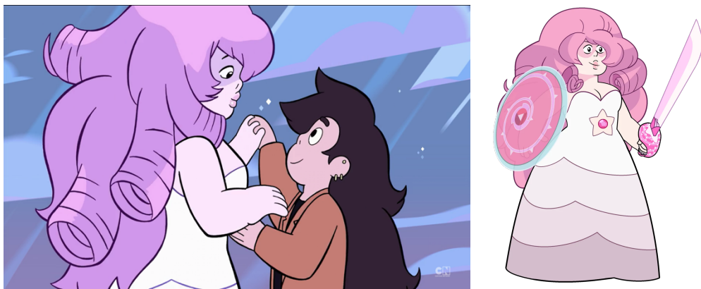
Figure 1 Left: Canon images of Rose Quartz (left) and Greg Universe (right) in episode 61, “We Need to Talk” (June 18, 2015); Right: Canon full view of Rose Quartz 2

Steven Universe is a children's cartoon on Cartoon Network that centers around the titular character Steven, who is the son of rebel alien leader Rose Quartz and washed up rock star Greg Universe. In the absence of his mother, who died while giving birth, Steven seeks to understand his half-alien nature and powers with the help of alien warriors known as the Crystal Gems: Pearl, Amethyst, and Garnet. The show features a diverse cast of both characters and voice actors and is very LGBTQ+ friendly.