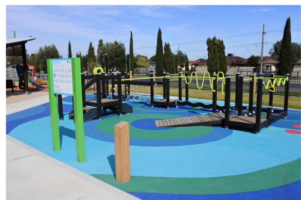
Fig. 2 The Senior Exercise Park (Lark Industries and Lappset Group) at Thomastown, Melbourne Victoria

The Senior Exercise Park equipment (Lark Industries, Australia) is outdoor playground equipment specifically designed for older people to improve strength, balance, joint movements and overall mobility and function (Fig. 2). It comprises multiple equipment stations that target specific function or movement (upper and lower