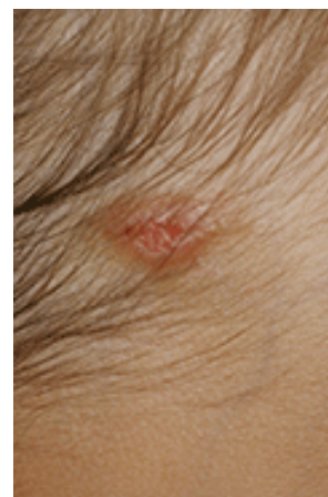
Fig. 1. A red nodule with crusts on the right forehead.