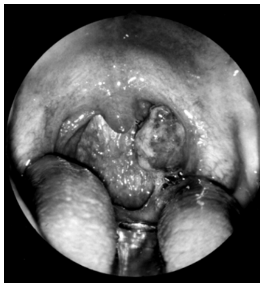
Fig. 1. Oral cavity of the present patient. There is a tumor in the upper portion of the left palatine tonsil.

The patient underwent a left palatine tonsillectomy under general anesthesia for removing the pharyngeal discomfort and for prevent-