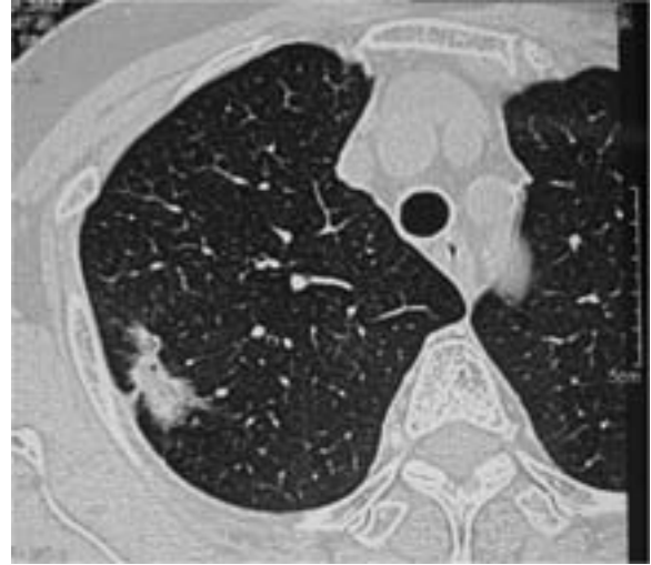
Fig. 1. In the preoperative chest computed tomogram, a 3-cm tumor with irregular margin on the right upper lobe was detected. We suspected lung adenocarcinoma.

with pulmonary adenocarcinoma. She therefore underwent a thoracoscopic right upper lobectomy and a mediastinal lymph node dissection. The operation took 240 min to complete with 170 g of bleeding and an intraoperative massage using intermittent pneumatic compression applied to her lower limbs as her progress continued to improve. Postoperative pathological findings showed a well-differentiated adenocarcinoma without lymph node metastases, and we concluded the IA disease of tumor-node-metastasis staging. The patient's postoperative vital signs were stable, and she started taking meals in a seated position at 18 h after surgery. She had difficulty breathing at 48 h after surgery when she was moved to a general ward, but her condition recovered immediately after oxygen was administered. After dinner, a nurse discovered that the patient was experiencing respiratory arrest, so cardiopulmonary resuscitation was immediately applied, and the patient was moved to the Intensive Care Unit, where she was put on artificial respiration. Echocardiography findings indicated a suspected collapse of the left ventricle and embolisms within the pulmonary arteries, so it was assumed to be a case of pulmonary embolism, and therefore the intravenous administration of 48,000 units of urokinase and 5,000 units of heparin was carried out. However,