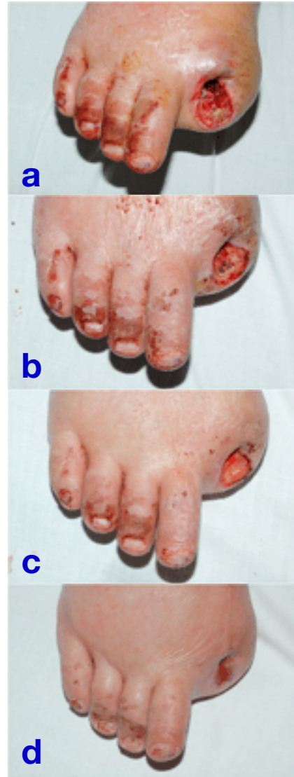
Fig. 4. Effect of the Vacuum-Assisted Closure (VAC) Therapy for the right leg. a: Before VAC. b: After 1 week of VAC. c: After 4 weeks of VAC. d: After 6 weeks of VAC.

Postoperative ABI was 1.08 on the right side. VAC was started on the 4th postoperative day and it rapidly enhanced wound closure in only 1 week in spite of MRSA infection. However, VAC gradually enhanced wound closure thereafter. The wound finally closed after 6 weeks (Fig. 4).