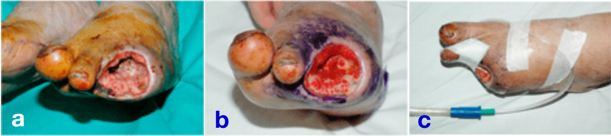
Fig. 1. Although we continued to disinfect and wash the open wound as usual for 30 days, it underwent methicillin-resistant Staphylococcus aureus (MRSA) infection and still remained open. a: 11 postoperative day. b: 30 postoperative day. c: A disposable exudates tube was placed at the wound site and a polyurethane film filled the wound including the tube.