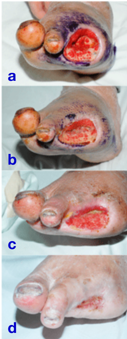
Fig. 2. Effect of the Vacuum-Assisted Closure (VAC) Therapy for the left leg. a: Before VAC. b: After 1 week of VAC. c: After 4 weeks of VAC. d: After 14 weeks of VAC.