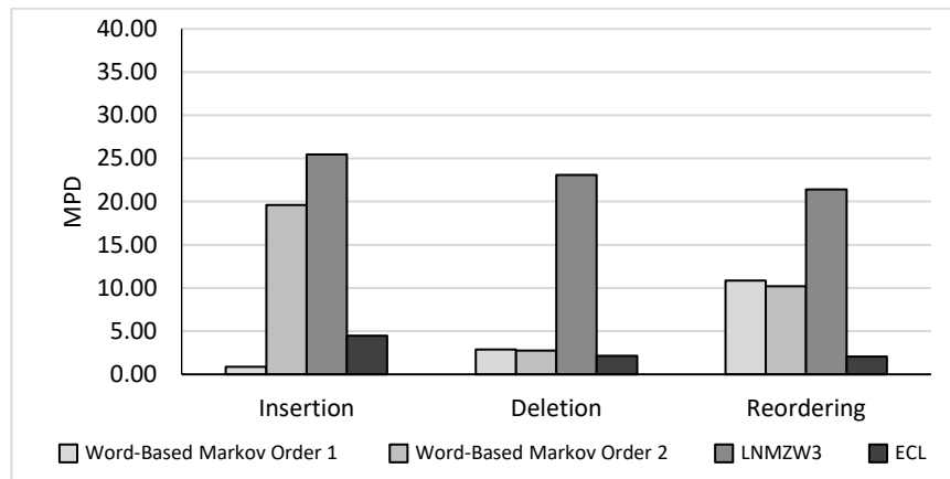
Figure 3: Mean Percentage of Deviation(MPD) in Tamper Calculation for 5% of Attack

The overall comparison of tested methods for 50% of attacks proves that the ECL method identifies the attack volume more accurately. Although, the word-based methods perform accurate tamper calculation for the small size of attacks, when the size of the attack increases the provided estimation are hardly accurate.