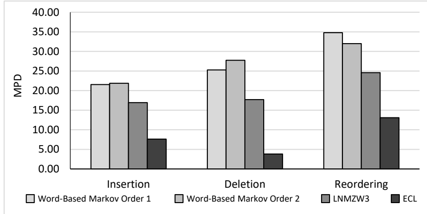
Figure 4: Mean Percentage of Deviation(MPD) in Tamper Calculation for 50% of Attack