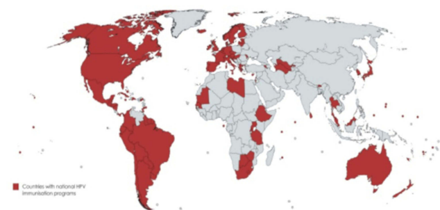
Figure 2 Countries that have introduced a national human papillomavirus immunization program using any of the three licensed vaccines (91 countries, 47%).

Abbreviations: 4vHPV, quadrivalent HPV vaccine; 2vHPV, bivalent HPV vaccine; 9vHPV, nonavalent HPV vaccine; FDA, The U.S. Food and Drug Administration; HPV, human papillomavirus; EU, European Union; VLP, virus-like particle.