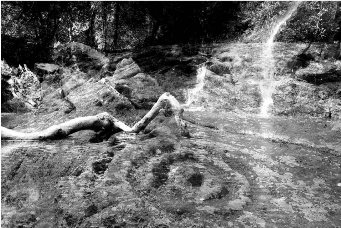
Figure 3. Paul Goodfellow Roughing Linn (2018–2019).