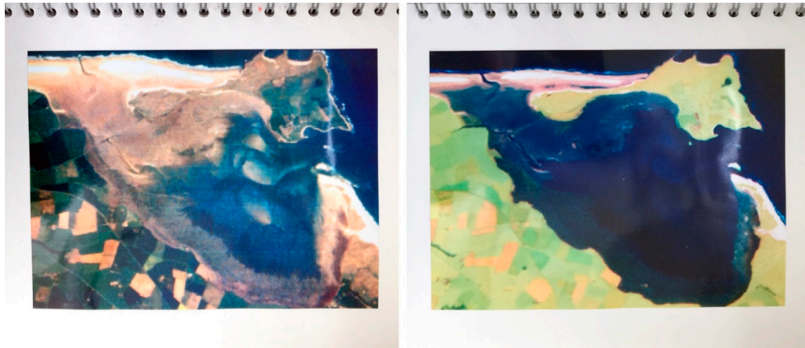
Figure 2. Holy Sands notebook: satellite images (photographs). (Left) to (right): Low-tide and high-tide. Photographs created by author of Landsat TM satellite data.

conceptual distance from the subject amplify the sense of the uncanny. As they shift our perspective from the embodied experience of moving towards the horizon to the vertiginous floating above which forces the eye to roam across vast stretches of embedded information etched into the surface of these virtual spaces (Steyerl and Berardi 2012). I was originally drawn to the satellite images of Holy Sands captured at low and high tide (Figure 2), as they as graphically prefigure the effects of climate change and consequently operate as symbols of sea-level rise.