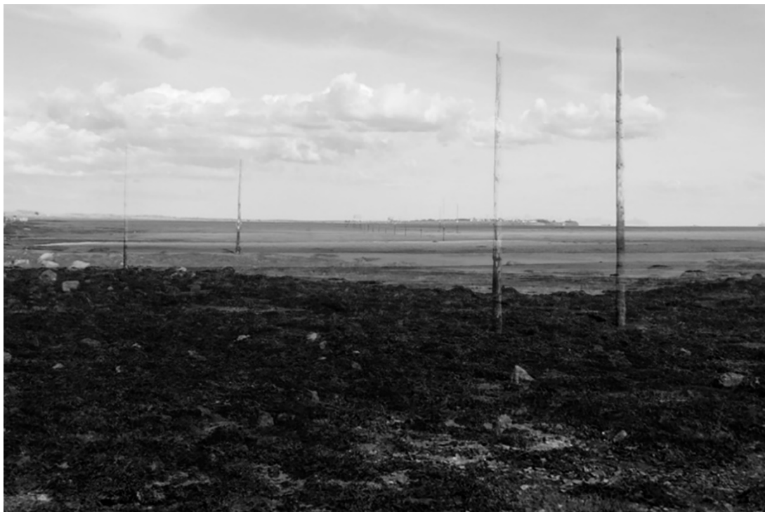
Figure 4. Paul Goodfellow Holy Sands (1991–2019).

In the case of the Ghost Photographs, there is a double haunting, as two irretrievable pasts are intersecting in the image. Likewise, retracing the steps of a book or film creates a multi-layered assemblage of ideas, narratives, and images which can be mentally etched into the landscape. This sense of the uncanny and eerie was present in the Flaubert walk of Rouen, as we were retracing the steps of the author, and his ghost and those of Emma and Charles Bovary were traced in the sensations of