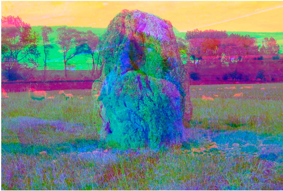
Figure 6. Paul Goodfellow King Stone/Battle Stones (2019).

This trace within the photograph can be understood from a geographic information perspective as the visualization of difference. As Fyfe and Law state, “A depiction is never just an illustration. It is the material representation, the apparently stabilized product of a process of work. And it is the site for the construction and depiction of differences” (Pickles 1995, p. vii). Thus, these algorithmic images visually materialize the difference between moments in time and point to layers of connection and relation operating in the world. These constructed images make visible the passage of time between the contained photographic events and allow the viewer to speculate on the future trajectory of these virtualized landscapes.