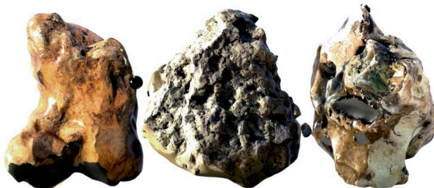
Figure 7. Paul Goodfellow Found Stones (2018–2019). Composite image created by author.

This trace within the photograph can be understood from a geographic information perspective as the visualization of difference. As Fyfe and Law state, “A depiction is never just an illustration. It is the material representation, the apparently stabilized product of a process of work. And it is the site for the construction and depiction of differences” (Pickles 1995, p. vii). Thus, these algorithmic images visually materialize the difference between moments in time and point to layers of connection and relation operating in the world. These constructed images make visible the passage of time between the contained photographic events and allow the viewer to speculate on the future trajectory of these virtualized landscapes.