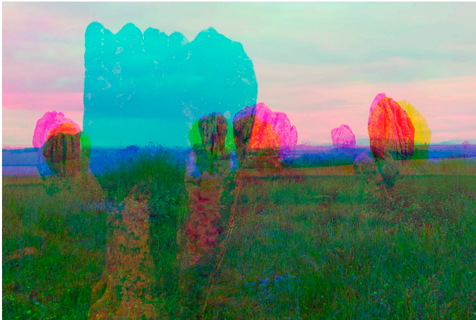
Figure 5. Paul Goodfellow Duddo Stones (2017–2019).

Barthes suggested that the long shadow of painting haunted the photograph, as we perceive the photograph in pictorial and tableau terms (Barthes 1993). It could also be argued that the algorithmic image is haunted by the photograph. Like satellite images, the constructed algorithmic images described here have the iconic appearance of photographs, but are not indexical records of a single event, or optical records of something that has taken place in the world. Instead, they are constructed through the application of production rules and algorithms. They are, therefore, both an index and iconic representation of the underlying algorithms and the walk, in much the same way that a satellite image is the product of the underlying algorithms. As Hoelzl and Marie observe neither the satellite, the computer, nor the camera is capturing the external reality, but an algorithmic event: