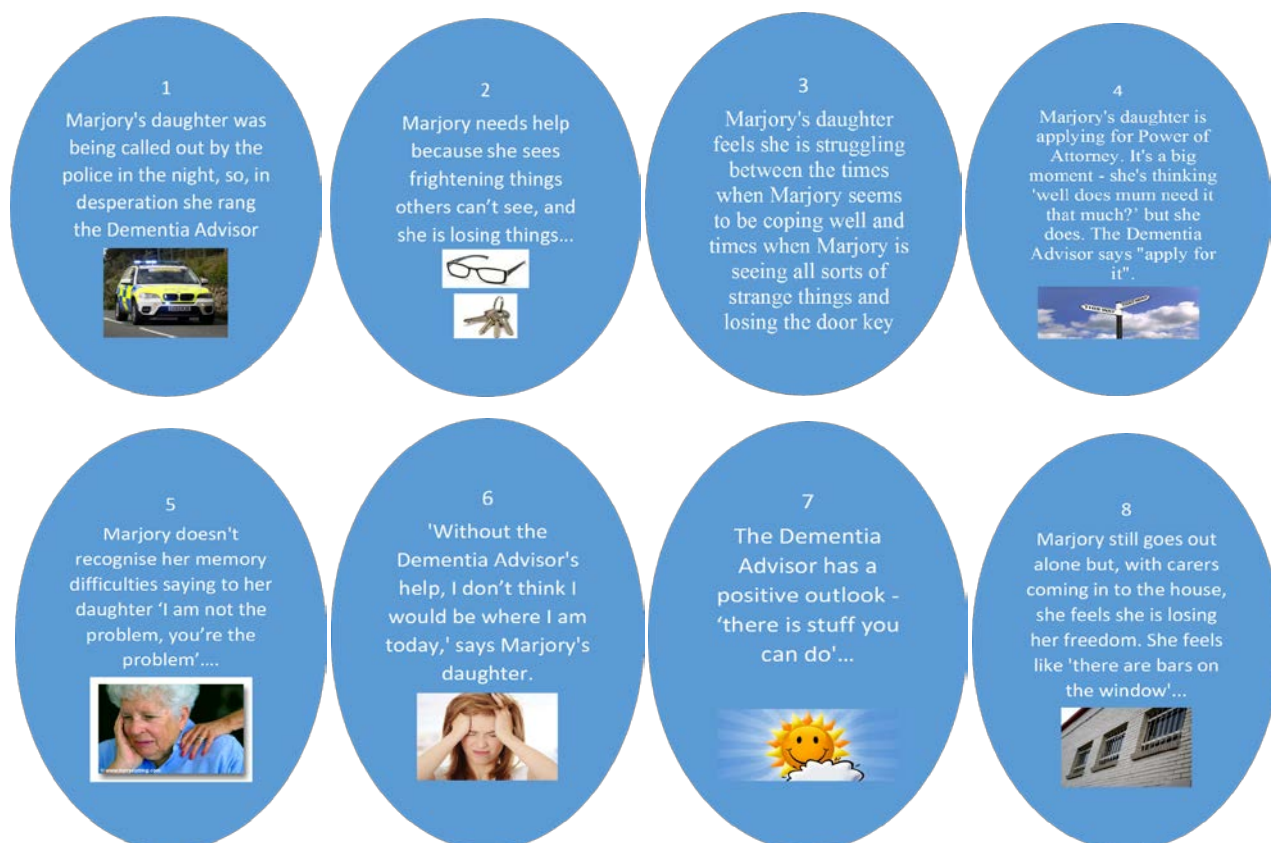
Figure 2 – Example of Picture and Word Cards Preparing for the Workshops and Using a Storyboard Approach to Data-generated Vignettes of People’s Experiences of Changing Groups