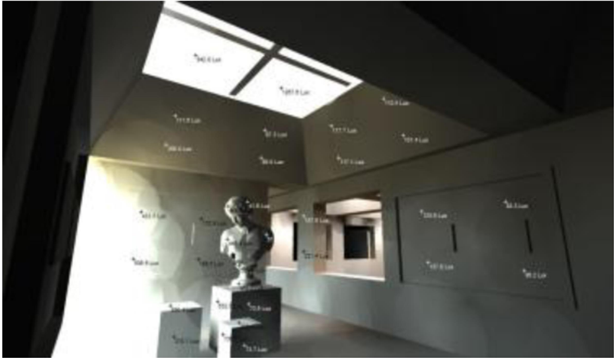
Figure 3. Selected illuminance readings of the upper floor gallery under overcast sky condition, presented in numerical values (RADIANCE simulation daylight modelling by the author) (Kaçel and Lau, 2014).

The roof lights, overlaying the building's entire roof, cover each of the four-subdivisions inside each of the structural grid (Hawkes, 2008). Unlike the design challenges in Fort Worth, consideration was focused on the daylight coming from the overcast and partly cloudy skies in addition to the direct sunlight. The collaborative design task for Kahn and Kelly was to create a well-balanced luminous environment diurnally and annually by means of the roof light and shading devices. The concrete beams supporting the roof was designed through their close collaboration, and they enhance the distinctive qualities of the roof light (Tanteri, 2010).