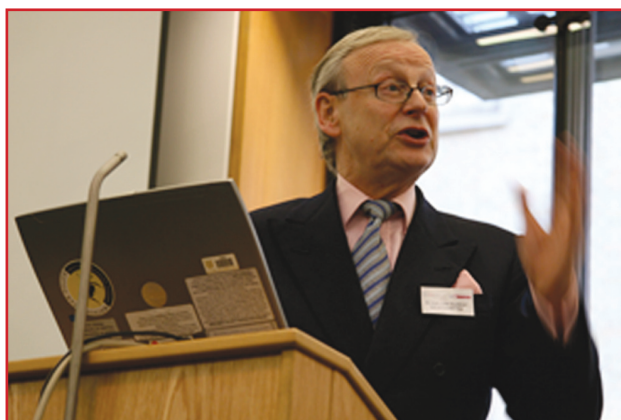
The Rt Hon John Gummer MP, Chairman, OECD Environment Committee

energy will be important alternatives in order to maintain the same pace of development in the future.