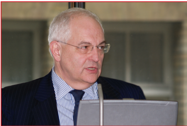
Martin Wolf, Associate Editor and Chief Economics Commentator, Financial Times