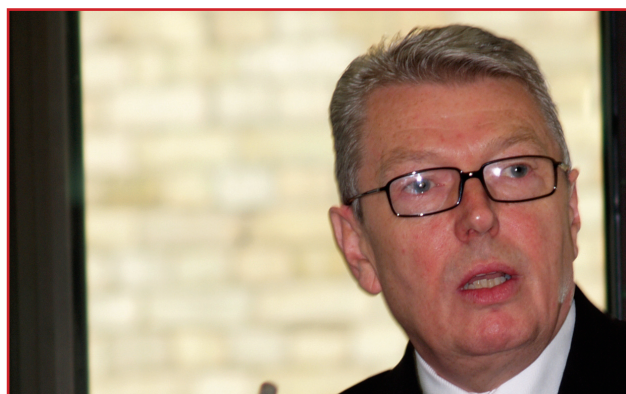
The Rt Hon Alan Johnson MP, Secretary of State for Education