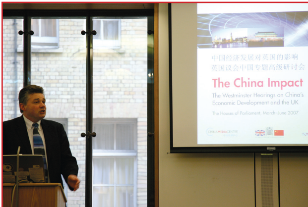
Ian Pearson MP, Minister of State for Climate Change & the Environment