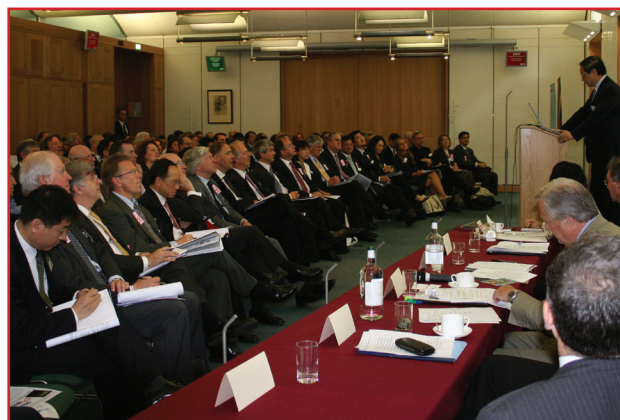
One of the hearings in progress

We need new forms of communities or affiliations.