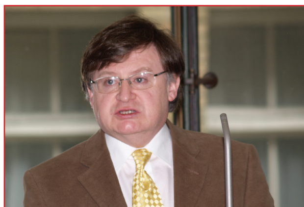
The Rt Hon Ian McCartney MP, Minister of State, Foreign and Commonwealth Office and Department for Trade and Industry