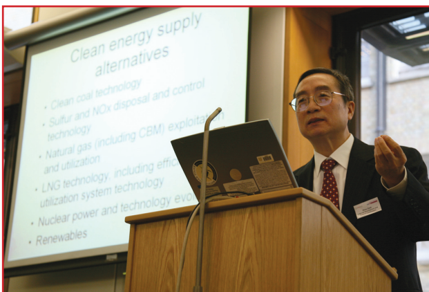
Zhou Dadi, Energy Commissioner, National Development & Reform Commission