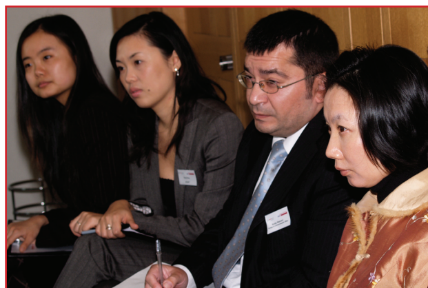
Attendees at one of the workshops

Some companies may look to make short-term profits rather than focus on long-term survival.