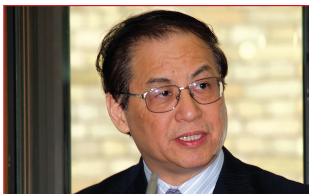
Mr Liu Mingkang, Chairman, Chinese Banking Regulatory Commission