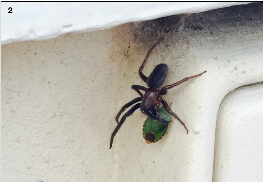
PLATE 3, Fig. 1. The silverfish Ctenolepisma longicaudata , Reading, 7 December 2014 ( \times 3 ). Fig. 2. Segestria florentina adult claspng the shieldbug Palomena prasina , Maidstone, Kent, 2015 ( \times 1.1 ).