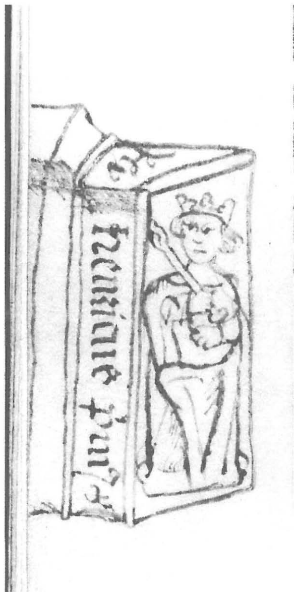
Fig. 1. Marginal illustration possibly representing the tomb of King Henry I at Reading Abbey in British Library Ms. Royal 20 A XVIII, fol. 172r. (Reproduced by permission.)