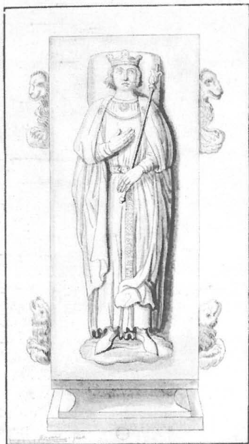
TOMBEAU de pierre à gauche en entrant par la petite porte dans l'Eglise de N. D. de Rouen.