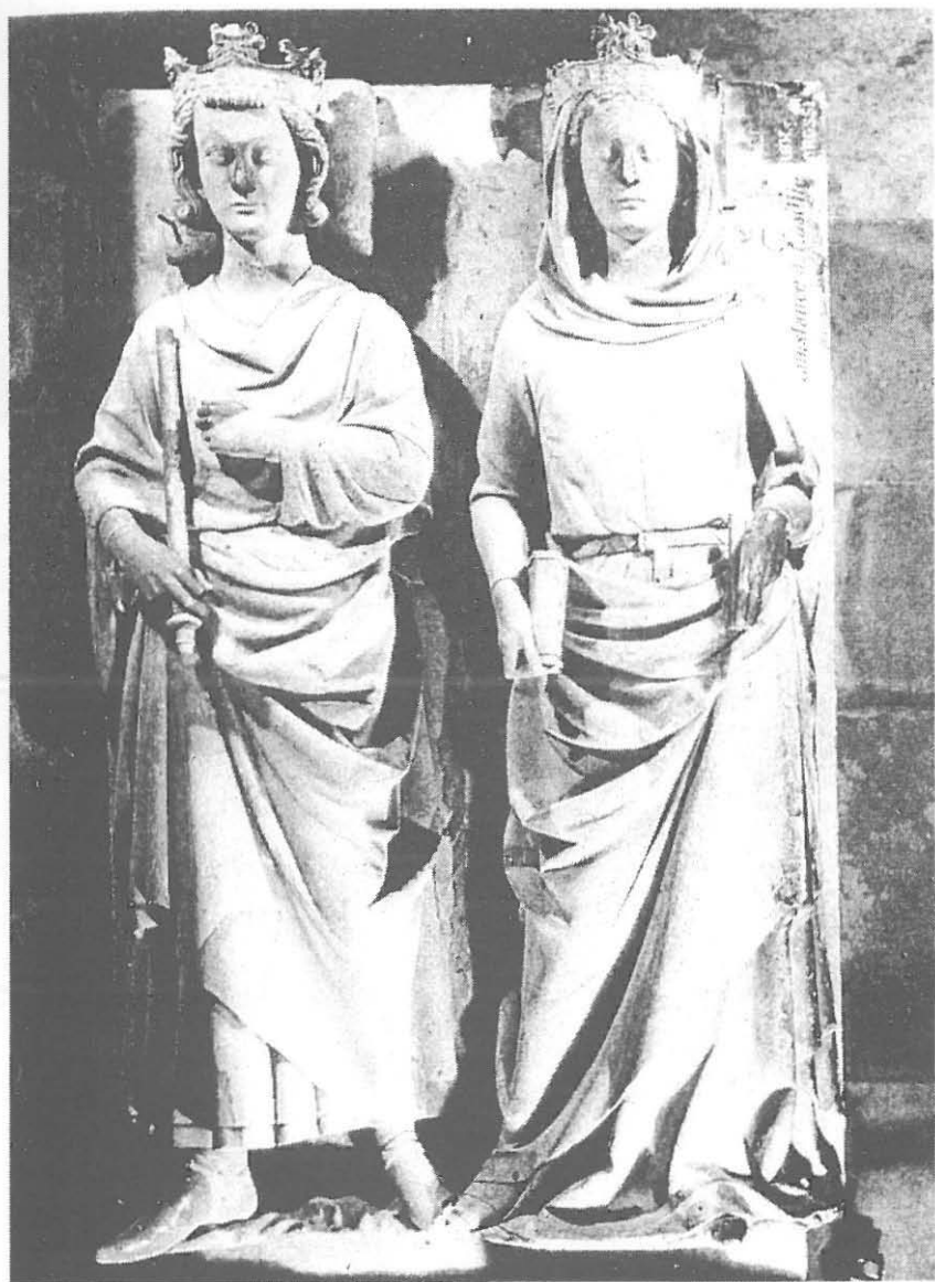
Fig. 4. Effigies of Philippe, son of King Louis VI of France, and Constance of Castile at St-Denis.