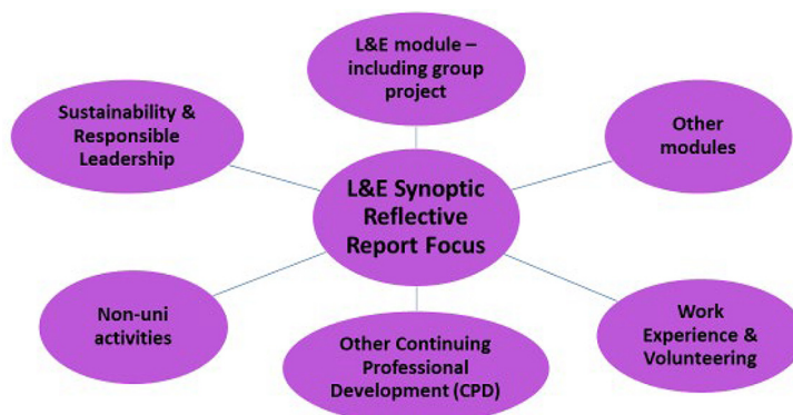
Figure 1. Guidance given to students for the individual synoptic reflective report within the L&E modules across the NBS undergraduate platform

At first sight, this might not appear bold, but what made this module stand out was the inclusion of the topic of "sustainability", both as part of the personal, individual reflective synoptic assessment, and also in a discipline-related group project, carried out in partnership with various internal and external agencies. Embedding sustainability education has been highlighted as a challenge by both researchers and practitioners ( Cebrián et al. , 2015 ; von der Heide and Lamberton, 2011 ). NBS's initiative to introduce the module was therefore bold considering this background. Rolling it out across all undergraduate business degrees was further testimony of the School's commitment towards embedding sustainability in the curriculum and ensuring delivery of the University's strategic goals ( NTU, 2010 ; NTU, 2015 ) and ultimately the sustainable development goals (SDGs) ( UNESCO, 2017 ).