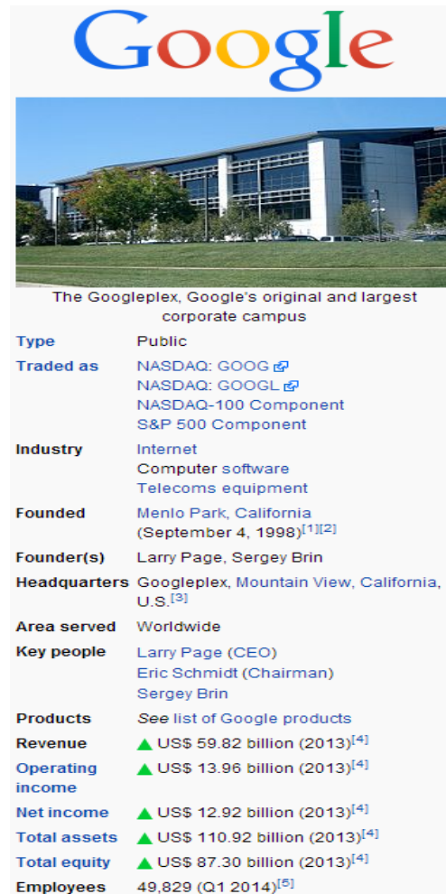
Fig. 1. Google Wikipedia article infobox 3

structured table, called infobox, summarizing essential attributes for that entity lives in the top right hand of each article [23]. It is the core attributes of the article infobox that this study stands on for the classification of named entities without any other prior knowledge. The snapshot in Figure 1 illustrates the Wikipedia article infobox related to "Google", which corresponds to a named entity of type Organization ( http://en.wikipedia.org/wiki/ ). The table summarizes very important unique properties of the entity in the form of attribute-value pairs. Consequently such tables are extracted, stored and analysed for the purpose of NE classification.