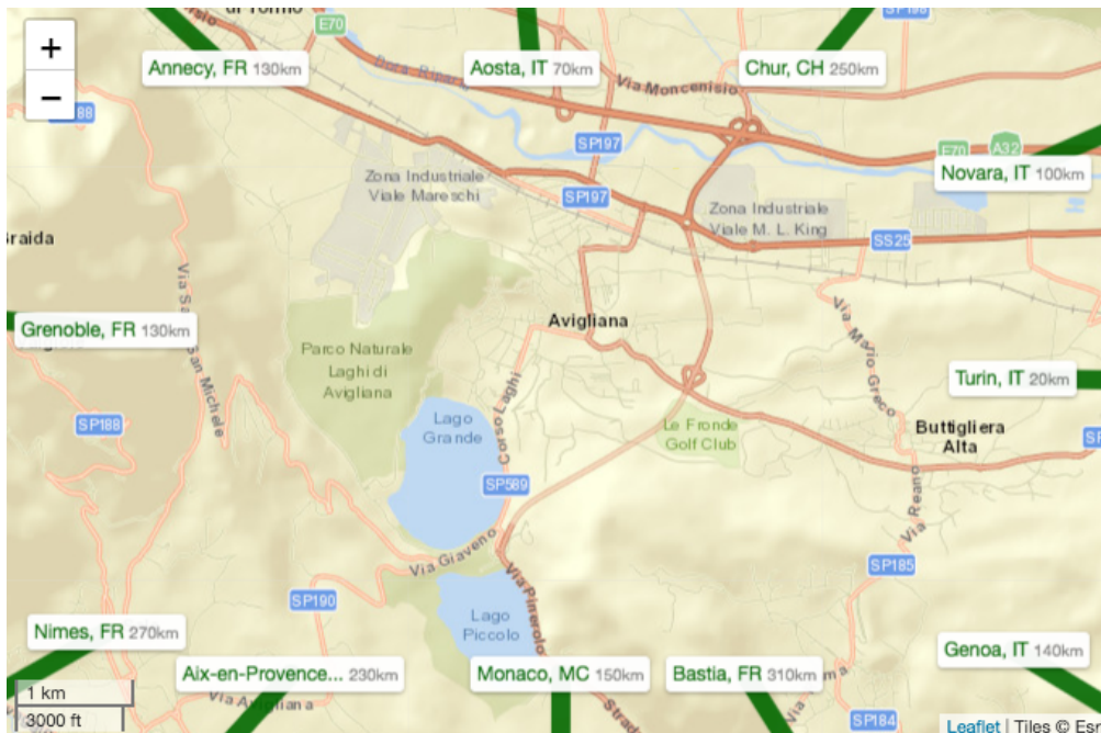
Figure 3: Context frame around Avigliana, in North-Western Italy, showing cities with the country code. The selection combines city distance and population ( w_d = .8 , w_p = .2 ). When clicking on a contextual cue, the map pans to it.

properties ( W_d + \sum W_p = 1 ). The line l is traced between the centre of the map and the closest point belonging to the object. A suitable shrinking factor to calculate the context frame bounds is x = .8 . Finally, 80 pixels was found to be an appropriate minimum distance m .