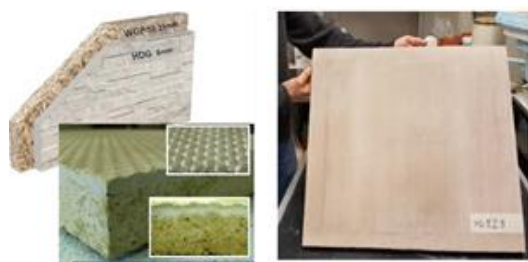
Fig. 3. InnoWEE ventilated façade panels: scheme (left) and prototype panels (right)

panel (WGP), thus providing light weight and mechanical strength. The panels are squares with a side sizing 59.5 cm and could be installed on supporting structures using the most common anchoring systems with a weight of 9 Kg/panel. The panels have been designed to withstand the most demanding seismic and wind loads in European countries.