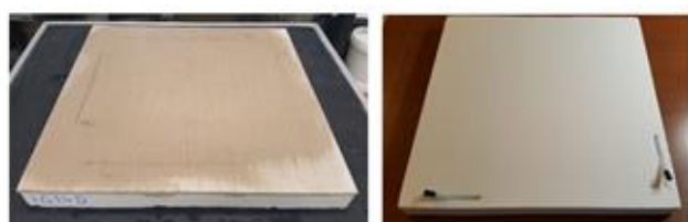
Fig. 4. InnoWEE radiant ceiling panels: front and back views

Radiant systems are designed for highly efficient low temperature heating and high temperature indoor cooling. The radiant panels have been designed and fabricated both for ceiling and wall application (Fig.4). Contrary to common plasterboard based radiating panels the InnoWEE panels are easy to dismantle and recycle due to the absence of gypsum in their formulation. The panels layout is a square of size equal to 59.5 cm that allows an easy mounting on common indoor ceiling systems that are designed for 60 by 60 cm tiles.