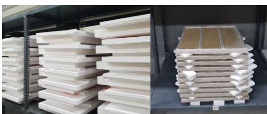
Fig.7. Upscale production of InnoWEE HDG panels (ETICs and ventilated facades)

Based on the outcomes of the preliminary design of the pilot plant and the modelling simulations, all the necessary modifications were conducted to the existing plant (TUPP). The ETIC and ventilated facade panels produced in the pilot plant are presented in Fig. 7.