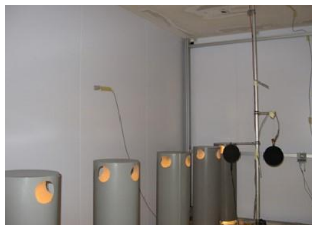
Fig. 10. View of the thermal chamber during a radiant ceiling test

The radiant panels prototypes are under testing in a dedicated test facility at the ITC-CNR laboratory in Padova [9]. The laboratory is a controlled test room where radiant panels could be installed and connected to a hot and cold water generation system. The facility is provided with a dedicated data acquisition and control system, that includes also the thermal dummies required by the standards, as shown in Fig. 10.