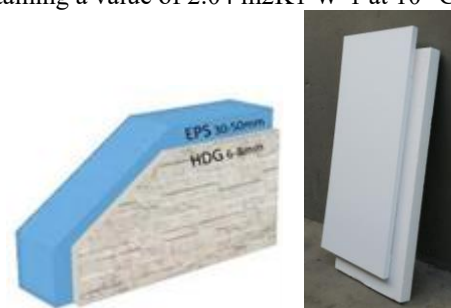
Fig. 2. InnoWEE ETICs panels: scheme (left) and panels produced in pilot production (right)

As opposed to conventional systems that are assembled on-site, in InnoWEE a new type of prefabricated ETICs was proposed. It consists of prefabricated insulating panels composed of an outer geopolymer layer and an inner EPS layer (Fig.2). The panels can be installed easily and fast, and they are extremely eco-friendly by using low CO 2 emissive geopolymer technology and recycling of large amounts of CDW (50% weight of the geopolymer binder). The panels are rectangular with a staggered layout, to facilitate the connection of adjoining panels and have a weight of 18Kg/sq m Substitution of individual panels can be done and easy end-of life recycling is guaranteed by their easy dismantling. The thermal resistance of the panels has been measured in laboratory, according to the EN 12667 standard, obtaining a value of 2.04 m 2 K/W-1 at 10 °C.