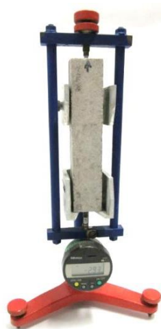
Fig. 9. Determination of alkali silica reactivity resistance of InnoWEE ventilated panel

Tests performed on panels from pilot productions confirmed that panels could be suitable for use as façade cladding. Capillary water absorption of panels after 24 hours was 1.8 \text{ kg/m}^2 , and testing of frost resistance has confirmed that there was no cracks or other type of damage after 30 cycles of freezing–thawing on both types of panels. Coefficient of water vapour permeability, which is relevant for ETICs like panels, was determined to be 44. By incorporating a mesh into the panels also impact resistance was improved, and it is now satisfactory for being used in Zone II group what means they are suitable for zone liable to impacts from thrown or kicked objects, but in public locations where the height of the ETICS will limit the size of the impact. Some long term durability tests are still in progress.