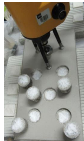
Fig. 8. Determination of bond strength (“pull off” test) on InnoWEE ETICs like panel

Based on the findings of Rilem TC DTA (Durability testings of alkali activated materials) which has set a series of methods for testing alkali activated materials (also geopolymer belongs to this group) regarding long term behaviour when exposed to severe conditions, also some parameter related to the durability have been tested or still being in progress [7]: