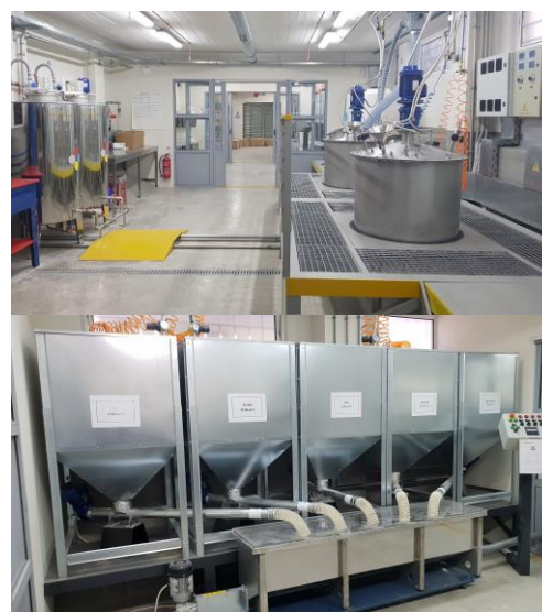
Fig.5. Pilot plant (TUPP) facilities used for InnoWEE upscale production of HDG panels

The basic flow sheet of the modified – for the purposes of InnoWEE- pilot plant (Fig.6), includes: