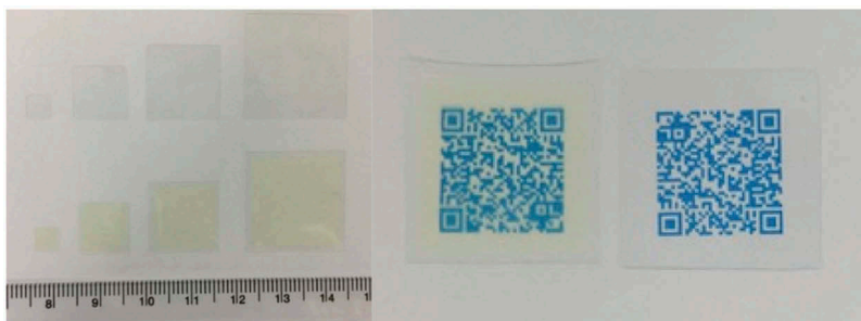
Figure 3. Examples of oromucosal films prepared with printing techniques (left: SSE printed warfarin films (transparent films) and inkjet printed substrates (yellow colorant in warfarin ink), right: QR code printed on substrates (blue placebo ink)).

3D printing, also called additive manufacturing, is associated with great flexibility regarding the size, geometry, and inner