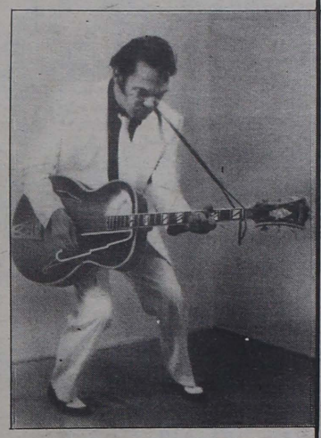
Neil Young's Album Cover

The Rockabilly craze is still happening and so are the Stray Cats. This is their second release in the United States and it has more of the music that made them famous. "Sexy and Seventeen" is the title of their current single featured on the album. However, the other songs on "Rant and Rave" are much wilder and will spark more interest than the aforementioned single release.