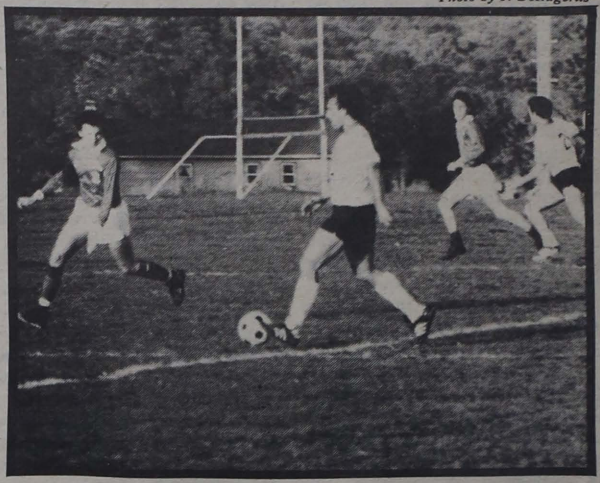
U.C. Player Charges Scranton Goal