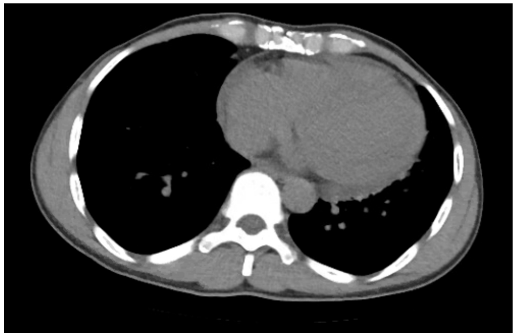
FIGURE 1: Admission computed tomography (CT) scan showing cardiomegaly

nausea, and worsening back pain. He was initially diagnosed with a musculoskeletal back strain and sent home from the emergency department. The patient returned to the hospital a few days later with similar symptoms. On exam, he was in distress, had elevated jugular venous pressure, bibasilar crackles on lung auscultation, and his extremities were cool and his skin was diaphoretic. A computerized tomography (CT) of the abdomen/pelvis without contrast was performed to evaluate for possible renal calculi. There were no identified calculi, however, he did have a new finding of cardiomegaly with small pericardial effusion (Figure 1). An electrocardiogram (ECG) showed a complete heart block with a junctional escape rhythm, ST segment elevation in leads I, aVL, aVR, and diffuse ST segment depression in the other leads (Figure 2). A bedside transthoracic echocardiogram revealed global hypokinesis with an estimated ejection fraction of 20%. Initial laboratory results were significant for a troponin of >25.0 ng/ml (<0.30 ng/ml), pro b-type natriuretic peptide (proBNP) of 9884 pg/ml (<125 pg/ml), and a lactic acid of 4.3 mmol/L (0.5-1.9 mmol/L). His physical exam along with these findings was thought to be most consistent with an acute myocardial infarction presenting with cardiogenic shock. Unfortunately, the patient was not able to tolerate left heart catheterization because he was unable to remain still and repeatedly contaminated the sterile field.