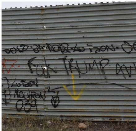
Figure 21. "Fuck Trump" on Grey Wall. Expletive written on possible sight where the Rape Trump mural was.

and a concise play on Trump's name, rerouting the figure of Trump for those that oppose him to something positive. Messages of unity, brotherhood, and love painted on the wall at this site follows the trend of street art's purpose along the border is to reroute, subvert, respond, and transform.