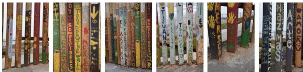
Figure 17. Tijuana Wall Text Sample. From left to right the text reads “Somos America,” “Tear down the wall,” “El arte es una extension de ser,” “Resiste sin odio, sin muros,” “No wall,” and “Haz mas arte.”

The site in Tijuana with the highest concentration of street art on or near the border was Playas de Tijuana, the public access beach area where the border fence meets the Pacific Ocean, and a little tourist spot with meandering food vendors, mariachi bands, and souvenir stands. There is a small park with benches, picnic tables, and a lookout for people to see up and down the beach. The border fence at Playas de Tijuana was nearly completely covered in text and drawings. Listed here are some examples of repeated ideas, phrases, and themes seen up and down the border wall at this site.