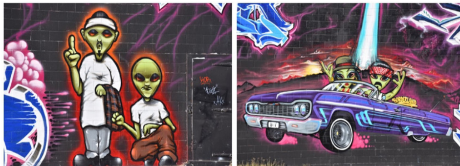
Figure 8. Borderland Aliens. A rerouting of the term "illegal alien" so often applied to Latinos of color, especially in the border region.

Figure 8 is the final piece of the sample of contextual art in and around Segundo Barrio and, like the Boy Lying Dead in Figure 7, is enormous in scale, yet made up of several smaller figures, text, and motifs. Painted on the side of a building on the edge of Segundo Barrio—a stone's throw away from the Rio Grande and the border—a warehouse wall is made up entirely of blue graffiti text (probably names of artists, though illegible to me) and images of human-like figures, dressed in Chicano-style street clothes, with green skin, and "alien" teardrop shaped heads. The paintings and surrounding text are highly detailed, brightly colored works in spray paint, but the most notable theme in this piece is the alien motif of the figures.