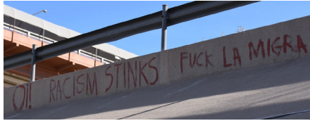
Figure 11. Oil Racism Stinks. Indicator of ongoing tensions between border patrol and residents on both sides of the border.