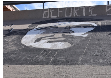
Figures 13 (left) and 14 (right). Nelson Mandela and Che Guevara. Two world-renowned political figures provide a contrast in favorability to depictions of Trump.

figures—one of Che Guevara and one of Nelson Mandela—not only because they were highly visible underneath the bridges, but also because they (like Benito Juárez of Figure 4 in El Paso) contrast starkly with the two portrayals of Donald Trump found in the culvert.