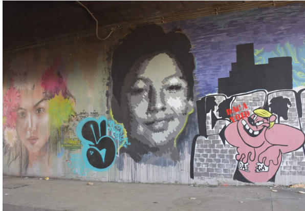
Figure 25. DACA Void. Cartoon Trump holds and rips a paper in half that says "DACA," as he glares at two other drawings of Dreamers.