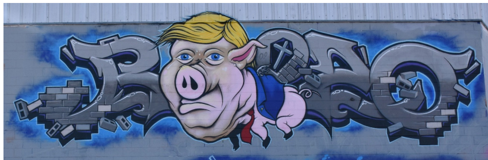
Figure 9. Pig Trump. Trump painted in a revolting way, inviting mockery as if he’s been caught with his pants down.

Figure 9 features one of two depictions of Trump found together on the El Paso side of the border in Segundo Barrio, and it is rich in detail. The figure has yellow-orange hair in Trump’s signature swooshed coif, the skin is light pink suggesting the figure is Caucasian, and the eyes, encased in two thick eyelids and without eyebrows or eyelashes, are a light blue color. The face is finished out with oddly-shaped bulging cheeks, one visible pig’s ear jutting out at an angle from beside the eyes, a few warts at the base of the ear, a large wrinkled snout topped with its own small swoosh of yellow-orange hair, colorless human-style lips resting in a small frown, and a low-hanging, shadowy set of skin folds below the chin and continues to where the head meets the rest of the body. The end of the body is rounded out with two bare buttocks and a short, curled tail.