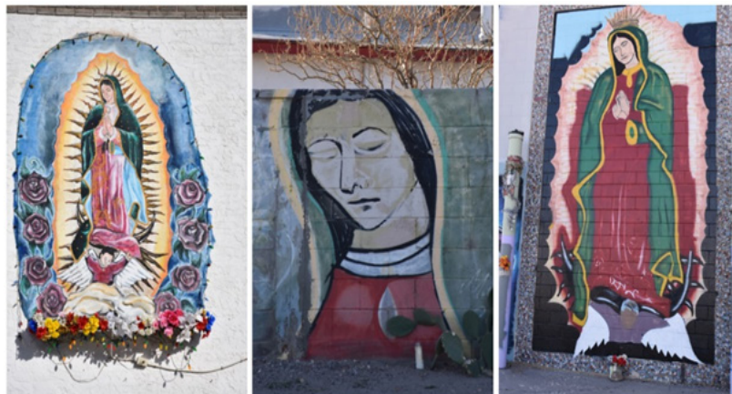
Figure 6. Virgin Mary. Three examples of the Virgin Mary in Segundo Barrio, a figure who represents Catholicism's strong presence in the borderland.

About one mile to the north of the Benito Juárez and Laughing Girl figures, the largest piece of street art in Segundo Barrio (Figure 7) appears on a side street mixed with residences and small businesses. It is situated on the side of long, one story building in front of an empty field. A young boy is depicted lying down dead on his stomach and side.