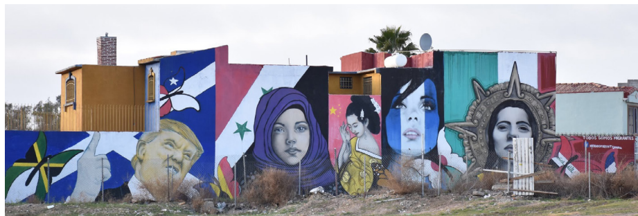
Figure 23. Trump and Four Women of Color. Large mural of Trump alongside four women from Syria, China, Guatemala, and Mexico. Smaller text in the right lower corner reads: "Todos somos migrantes," which means "We're all migrants."