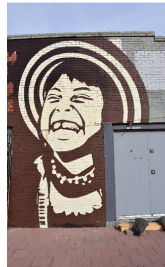
Figure 5. Laughing Girl. Portrait of a young girl, laughing, two stories tall, with a halo-like frame around her head.