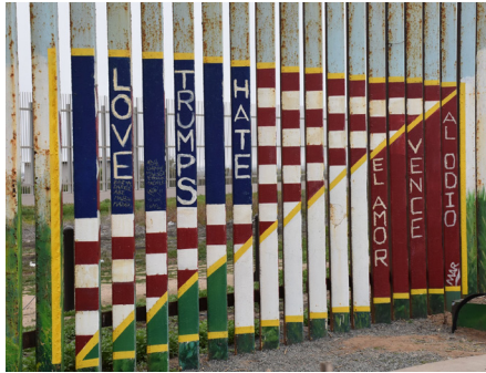
Figure 20. Love Trumps Hate. This hybrid flag shows the unity of the two countries despite what is perceived as hateful speech by Donald Trump.