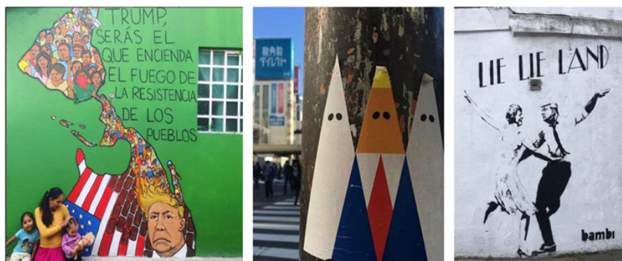
Left: Figure 1. Resistencia de los Pueblos . A mural on the walls of a migrant shelter in Tabasco, Mexico. The text translates to “Trump, you will be the one who ignites the fire of resistance of the people.” Artist unknown. Center: Figure 2. KKK Trump . Depiction of Trump as an affiliate of the Klu Klux Klan. Credited to the Japanese artist @281 Anti Nuke . Right: Figure 3. Lie Lie Land . Trump and British PM Theresa May. By the artist @bambi .

Anti-Trump street art has been observed all over the world since the beginning of the 2016 presidential campaign, three examples of which are shown in Figures 1, 2 and 3. A collection of sixty-five anti-Trump street art pieces in The Huffington Post (Moran 2017) lists the wide range of locations around the globe anti-Trump sentiment has found a public audience. Across North America, South America, Europe, Australia, the Middle East and Asia, as well as on social media platforms like Twitter and Instagram, Trump's likeness has popped up on urban furniture and in the digital public in subversive forms. The majority of the images in the compilation, when shared on social media, were accompanied with hashtags such as #trump, #donaldtrump, #dumptrump, #drumpf, #alleyart, #streetart, #anti trumpstreetart, #icanteven, #humanrights, #refugeeswelcome, #nastywoman, #pussygrabber, #notmypresident, #makeamericagreatagain, and #makeamericamexicoagain. By accompanying these images with one or more hashtags, the artists—or social media users who discovered the art on the street—invite the viewer to continue their engagement with the art online. Figures 1, 2, and 3 demonstrate the tactic used by street artists of combining locally significant, globally resonant pop culture figures and themes into messages that are meaningful to more people. The street art found on the border also uses this tactic.