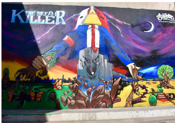
Figure 26. The Dream Killer. Large mural of Trump uprooting humans/trees on the US side and dumping them in Mexico.

single red eye, and painted in a bright straw-gold yellow as a signifier of Trump's most widely recognized physical attribute, his hair color and style. His clothes also include a red band around his upper arm with a white circle and black dollar sign, and the tip of his tie drapes over the cement wall he is on and features a circled star in red. Only his torso is showing and outstretched to both sides are his arms. His right hand (showing Caucasian skin different from his all-yellow head) clutches an anthropomorphized tree/woman. She has been uprooted by Trump and is being moved towards the other side of the wall where other uprooted trees lay on the ground with blood around them. Trump's left hand lets go of one such tree wearing a graduation cap and holding a diploma as they are dropped headfirst on what is assumed to be the Mexican side of the border.