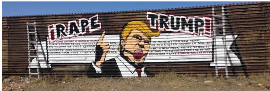
Figure 22. Rape Trump. A direct reaction to Trump's claim that Mexican immigrants are rapists. The smaller text is directions to Trump Tower in New York City.

This immense mural touches on several themes relevant to the local community of Tijuana, but like the political figures in the cement culvert of Juárez, they also reach outward to resonate globally. Butterflies, as a favorable metaphor for migration, again make an appearance