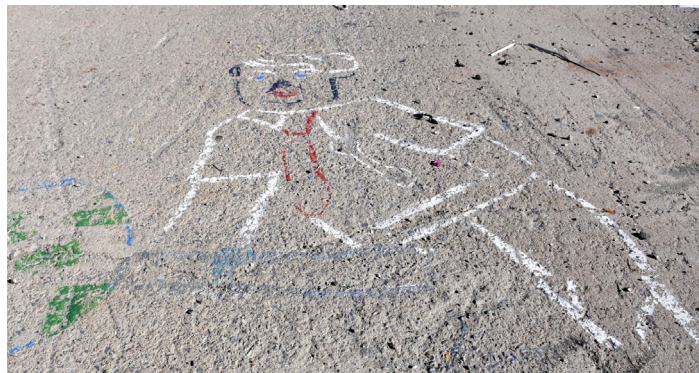
Figure 15. Chalk Trump. The figure of Trump is shown on his knees holding his penis, which is pointed towards a globe.

In contrast to the portraits of Guevara and Mandela, two separate large pieces in the culvert show Donald Trump. The first is done in chalk, and includes the text “He is fucking the world.” The figure of Trump is shown on his knees holding his penis, which is pointed towards a globe. The entire drawing is done simply: Trump’s body and hair is outlined in white chalk, his face is outlined in black, and he is given blue eyes, a red mouth, and red tie. In front of him is a blue and green globe, and below, the text is outlined in blue and green block letters.