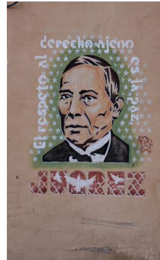
Figure 4. Benito Juárez. Immortalized hero of Mexican nationalism, defender against foreign intervention, and icon of indigeneity.

Because her eyes are closed, she neither looks back at the viewer nor her surroundings, and she is completely absorbed in her happiness, high above the pedestrian viewer.