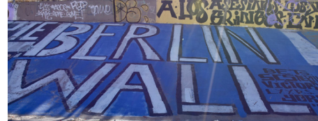
Figure 12. Berlin Wall. A parallel label given to the US-Mexico border, in the hopes that it will be torn down one day, too.