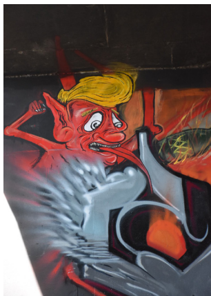
Figure 24. Devil Trump. Trump literally being demonized and marked as a perpetrator of a certain kind of hell.

The second (Figure 25) shows Trump as a small, rounded cartoon character, hiding behind some large illegible text (again, probably an artist’s signature) that is styled similarly to the El Paso paintings of Trump with cinderblocks feature in the lettering. The cartoon character holds two halves of a torn white paper that reads “DACA” and above his head are the stamped and stenciled words spray painted in red that read “DACA VOID.” Situated as a short character, he looks up at the “DACA VOID” text and beyond that to two large portraits of young female Dreamers. He is shown as creepy and conniving as he leers at the two young women with a malicious grin.