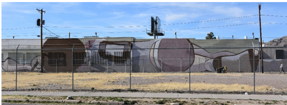
Figure 7. Boy Lying Dead. A symbolic enlargement of death's unjust and persistent presence for migrant children in the area. Note pedestrian at bottom right for scale.