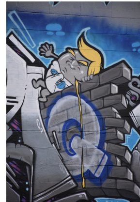
Figure 10. Humpty Dumpty Trump. Trump diminished in size and nursery rhyme imagery, suggesting his failure is certain, imminent, and irreversible.

Figure 10, situated in a similarly-sized line of graffiti text just below the Trump/pig art in Figure 9, is a large set of spray painted text and images in the same graffiti style. This drawing is, of course, based on the popular and enduring children’s fairy tale rhyme: “Humpty Dumpty sat on a wall; Humpty Dumpty had a great fall; all the king’s horses and all the king’s men; couldn’t put Humpty together again.” Trump is Humpty Dumpty, he is pictured atop a wall, and his eggshell body is cracked and broken as he has a “great fall.” Egg yolk, either ingeniously or conveniently color matched to his hair and eyebrows, drips from the side of his body down the wall he is falling from.