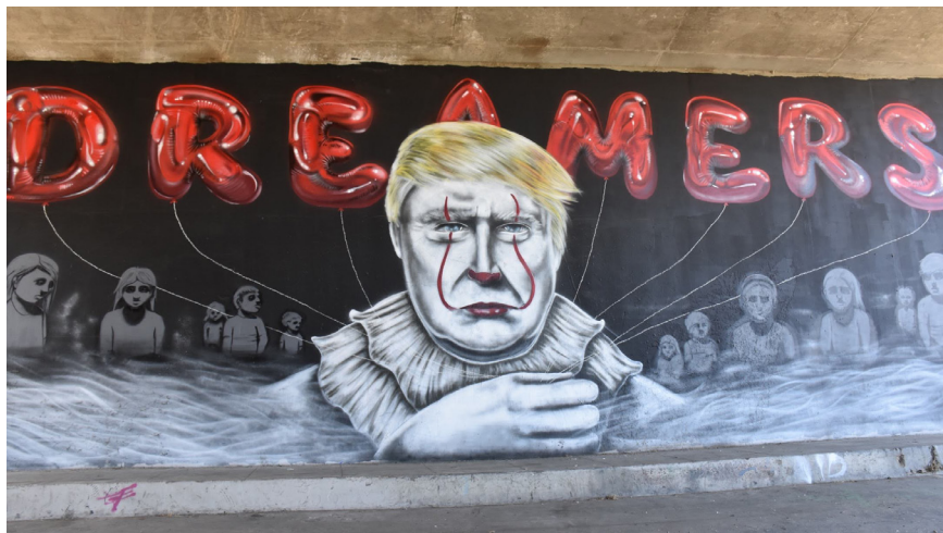
Figure 27. Dreamers. Large mural of Trump as a clown, luring in children with red balloons.

The final Trump piece in the Long Beach sample is a streamlined mural of Trump as the clown It , based off of characters and content from the 2017 release of a remake of the horror film It . Trump, like the title character of It , is wearing a clown's outfit with a ruffled, layered neck piece, and his face is painted in white with two red lines drawn from his red lips up over his cheeks and into his forehead. The lines subtly become the shape of horns as they reach his forehead. His expression is a determined scowl, and he, like most of the children behind him, gaze directly at the viewer.