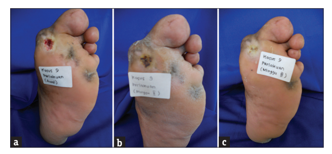
Figure 2: (a) Before treatment. (b) Second week after treatment. (c) Ulcer completely healed on third week after treatment

We anticipated allergic contact dermatitis resulting in ulcer deterioration as a possible complication of our study. It was decided that in case such events were to occur, gel application would be stopped and complications managed. To preemptively minimize complication risk, study participants were asked to avoid long periods of standing or walking and were not given tasks involving carrying or unloading heavy weights.