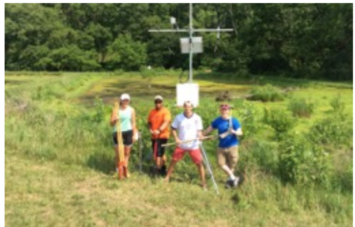
Summer student researchers joined together for a high-tech work party and installed a network of state-of-the-art weather station and water level instruments at the agricultural treatment wetlands at Ards Farm in Lewisburg, PA. This work is being done in cooperation with Ards Farm, the Union County Conservation District and the Buffalo Creek Watershed Association.