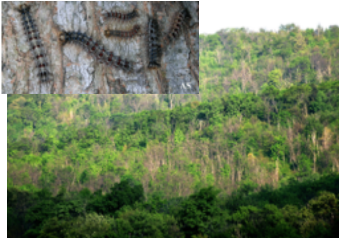
In 2015, gypsy moth caterpillars, which came from Europe and Asia in 1869, caused nearly 700,000 acres of defoliation to Pennsylvania forests.