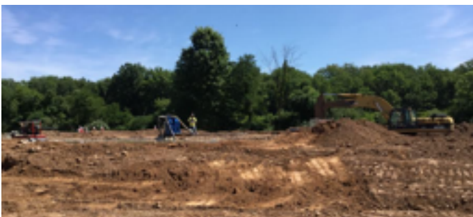
The new slurry wall being installed. Bentonite mixer visible on left and backhoe digging the trench on right.