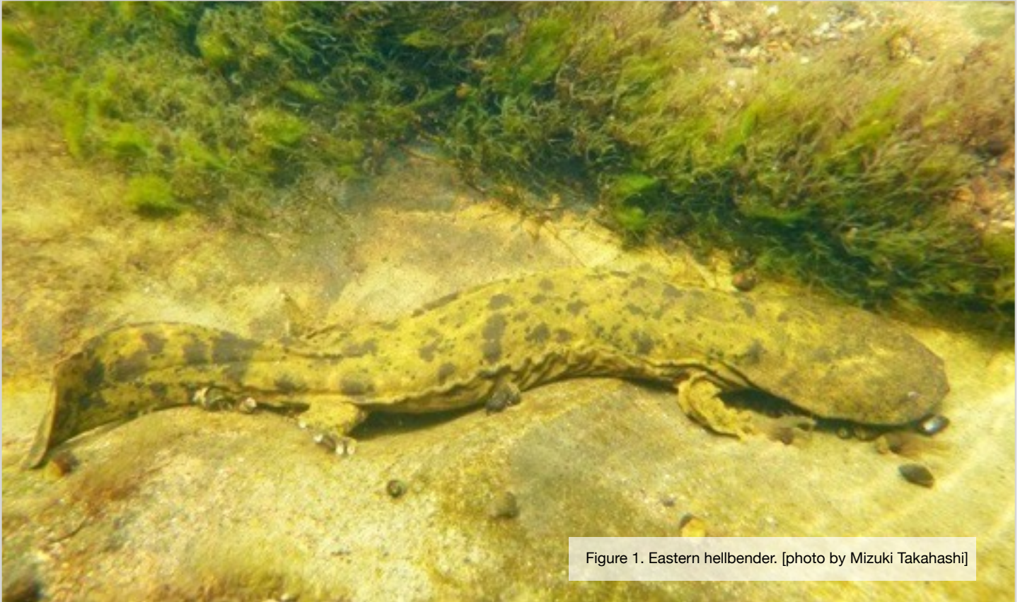
Figure 1. Eastern hellbender.