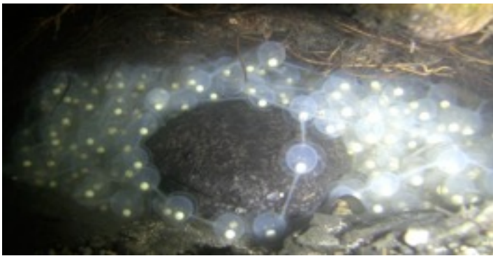
Figure 5. Male Japanese giant salamander caring for the eggs in his nest, Tottori, Japan.

My colleagues in Japan and I have studied reproductive ecology of Japanese giant salamander for the past years and provided the first quantitative analyses of male parental care behaviors in this family of salamanders (Fig. 5). Parental care by females is commonly observed among salamanders and is generally associated with terrestrial reproduction with internal fertilization. On the other hand, parental care provided by male salamanders is rare and associated with aquatic reproduction with external fertilization. We found that male Japanese giant salamanders exhibit a diverse array of care behaviors such as 1) tail fanning to provide oxygenated water for the eggs, 2) agitation of the eggs to prevent yolk adhesions and promote healthy embryo development, and 3) removal of unfertilized, dead, or water-mold infected eggs to prevent the infection from spreading over the entire clutch. Our lab is currently collaborating with Asa Zoo in Japan on the analyses of the nesting behaviors recorded by a video camera.