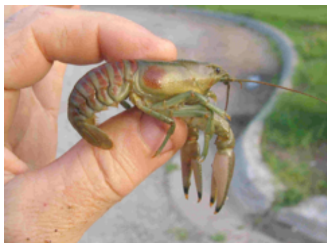
Rusty Crayfish ( Orconectes rusticus ), an invasive invertebrate species, is now found locally in the Susquehanna River. It is a very aggressive species, known to eat and out compete native crayfish species and even eats small fish. The impact of its presence on the aquatic ecosystem is uncertain.