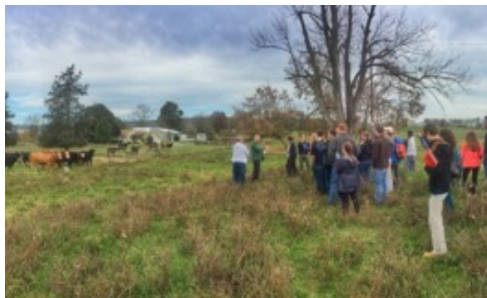
Rich Crago leads a group of Hydrology students on a tour of a Mennonite farm in Union County to look at how water runoff in fields and pastures concentrates into flow paths.