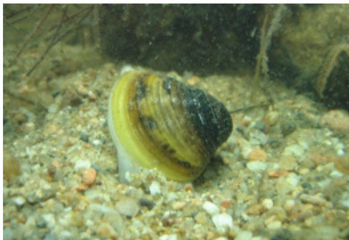
Asiatic Clam ( Corbicula fluminea ), an invasive mussel species, is now found throughout the Susquehanna River basin. It is thought to be introduced into Columbia River as a food item by Chinese immigrants. The impact of its presence on the aquatic ecosystem is uncertain.

The River Reporter cannot tackle all of these challenges, but we hope, in the next few issues, to provide some information on some of the water-related challenges important to the Susquehanna River, and to those who live in its “Sphere of Influence.”