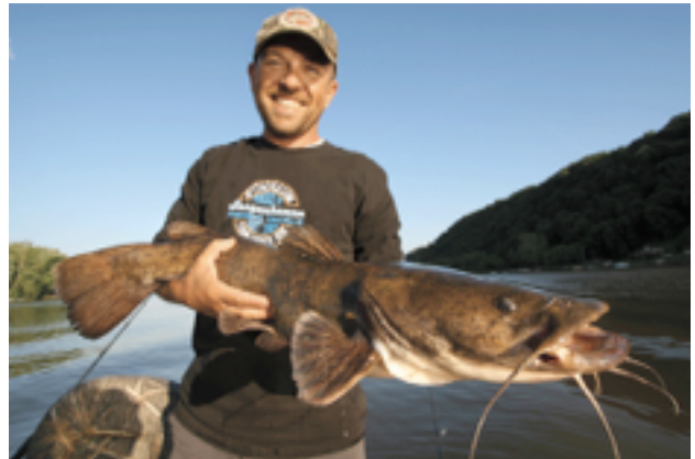
Flathead catfish, introduced in the lower Susquehanna River for sport fishing, are rapidly making their way north of Harrisburg, PA.