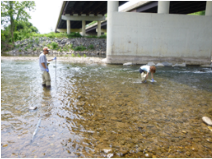
Figure 3. Water sampling in Pine Creek