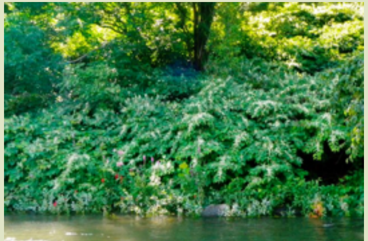
Japanese knotweed growing along the banks of the Susquehanna at Milton State Park.

Her findings show that plots in sites invaded by P. cuspidatum are significantly less species diverse than those in intact plots. Species recorded within both communities, such as the common blue violet ( Viola cucullata ), smooth Solomon's seal ( Polygonum biflorum ), and green dragon ( Arisaema dracontium ), had significantly reduced densities in the invaded plots compared to the intact plots.