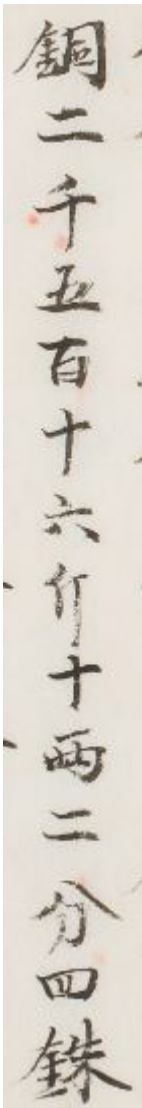
Figure 1. Sample description of a compound measurement for copper in the Engi-Shiki .