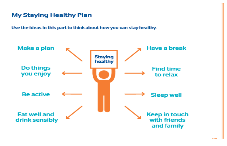
Figure 1: My Staying Healthy Plan (FPLD 2014)