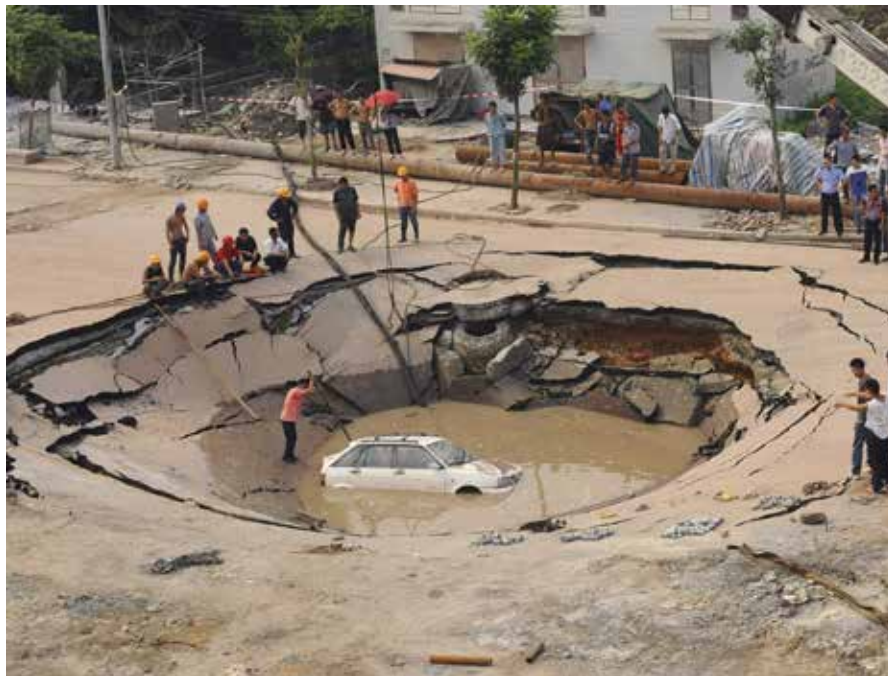
Above: Source image of sinkhole in Guatemala City

sinkholes, including the 26' wide by 52' deep pit created in the Shenzhen region of China in 2013 and the 2010 occurrence in Guatemala City, Guatemala, which spanned sixty feet wide and approximately thirty stories deep. By sculpturally depicting these devastating geological occurrences, Fasnacht turns the relationship between event and documentation into a personal and precarious action.