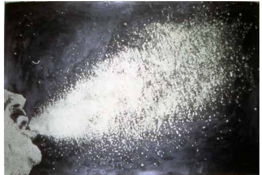
Above: Blast , 1997-1998, Graphite on Paper, 22" x 30"