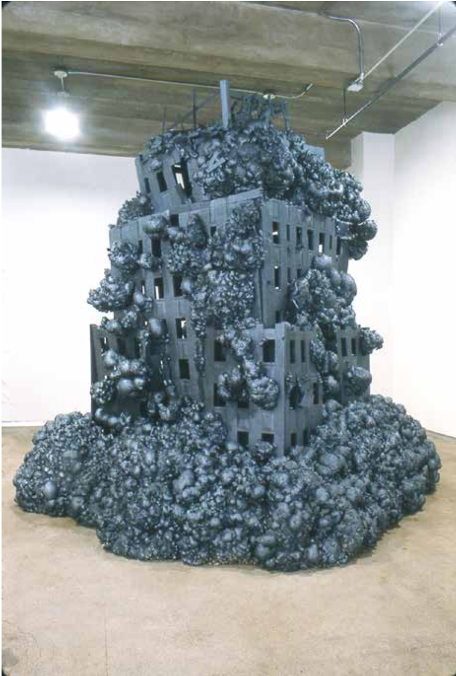
Above: Demo , 2000, Polychromed Neoprene, Styrofoam, 112" x 125" 120"