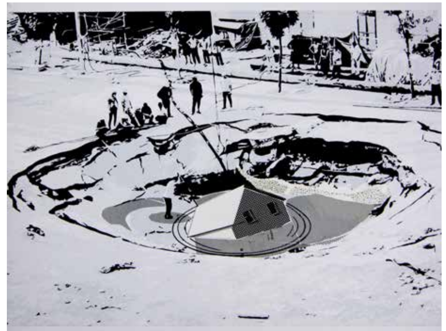
Above: Suspect Terrain (Artist's Rendering)

“I take the collapse as a plan to reconstruct in however fractured a fashion. These become