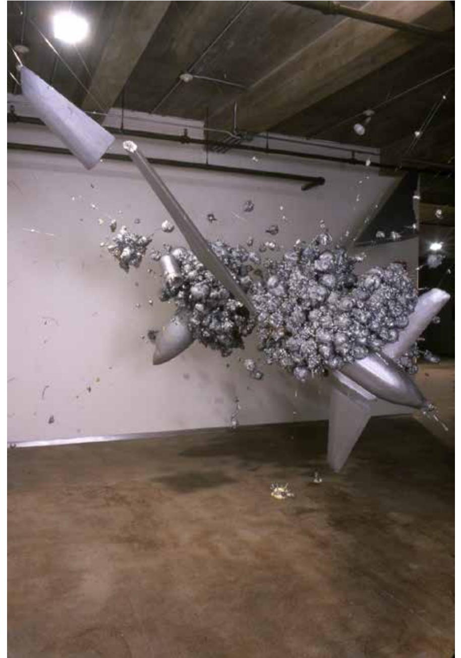
Above: Exploding Plane , 2000, Graphite Acrylic over Neoprene, Dimensions Variable (approx 20' sq)