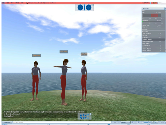
Fig. 7 "At about 11:00 AM, Linden, Ruth arrived on an OpenSim server, quite quietly."

"All three Avatars had been logged on via the Agent Domain in the Linden Lab Aditi test grid. The Agent Domain took a "place_avatar" request from the client, and issued a "rez_avatar" request to the OpenSim, which handed the Agent Domain the necessary details so it could relay it to the client, and permit a login. We're all Ruth, because we're not yet syncing the agents with openSim inventory yet. That's just a small matter of programming... (Well, that's what we programmers always say.) We have no inventory, and we're stuck on the single region. But... it's a very nice first step."