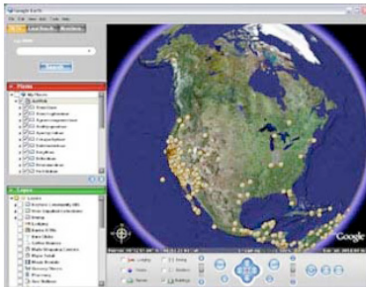
Fig. 2 Google Earth Home Screen, N. America

The first category is virtual worlds, which are discussed in this report. The second category tipped for steady growth is Mirror Worlds, informationally-enhanced virtual models or 'reflections' of the physical world which incorporate mapping, modelling and annotation tools, plus geospatial sensors and other location-aware technologies. Mirror Worlds may also offer what they term 'lifelogging' facilities – the third category – that are the ability to record the history of an activity. An example would be Google Earth and the way it is providing an increasingly annotated image of the world.