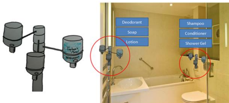
Figure 2: The fourth iteration of the group's overall product concept

All students claimed to have learnt a significant amount through the exercise, and most had enjoyed the time: they felt they had an adequate chance to appraise the agile methods and to identify advantages and disadvantages associated with the methods they had used.