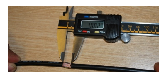
Figure 4. Shape and size of the 10 mm fault created on the insulation and braiding of an RG59 coaxial cable.