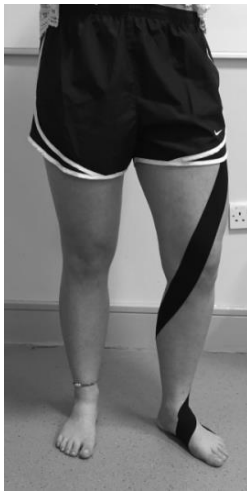
Figure 1. Kinesiology taping application

Before participation within this study each subject completed a health screen questionnaire and informed consent form in order to assess their suitability for the project and gain their approval, gate keeper consent was also enforced. All informed consent forms were stored in a locked filing cabinet. The research proposal for this study was sent and approved by the York College (York, UK) ethics committee. Participants were given the right to withdraw from the project at any time, and all data collection was conducted under the supervision by a qualified physiotherapist.