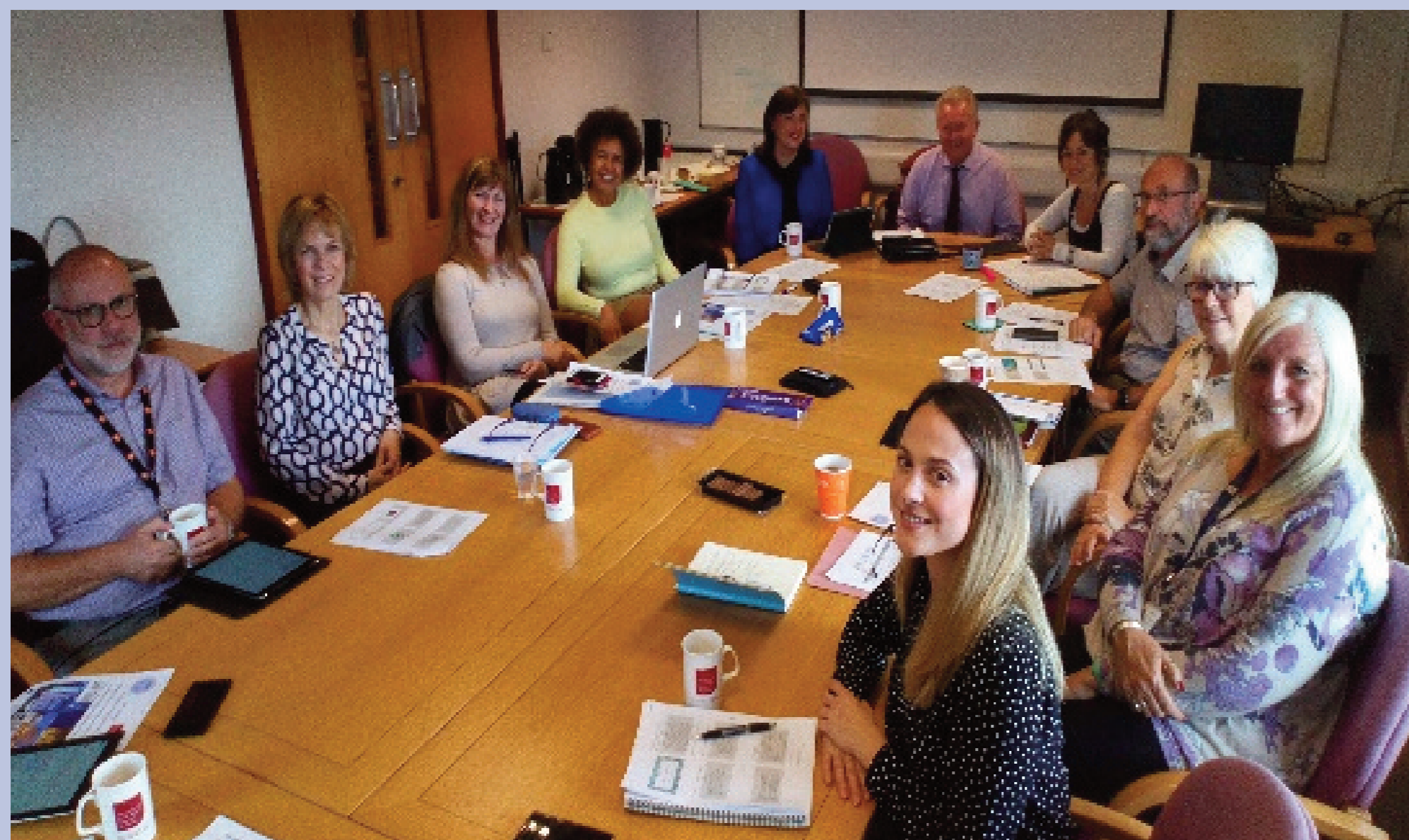
All Wales Spirituality Health and Wellbeing Group (SHaW)