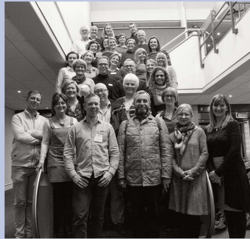
EPICC participants from across Europe