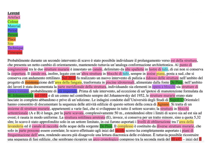
Fig 2: Annotated text in HTML format

An example image of an "inlineHTML" file, showing the various fragments of texts recognised in a report by the tool and the associated conceptual entities in different colours is presented below.