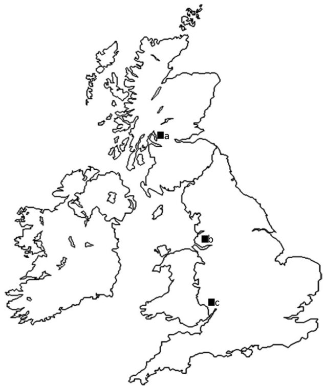
Fig. 1 Geographical representation of the study sites. a Scottish Centre for Ecology and the natural Environment, b North West sites (Ruff Wood, Scutchers Acres, Gorse Hill Nature Reserve, Mere Sands Wood Nature Reserve) within a 7-km radius, c Nagshead Nature Reserve

The study was performed during the breeding seasons of 2014, 2015 and 2016 across six sites. Most of the study sites