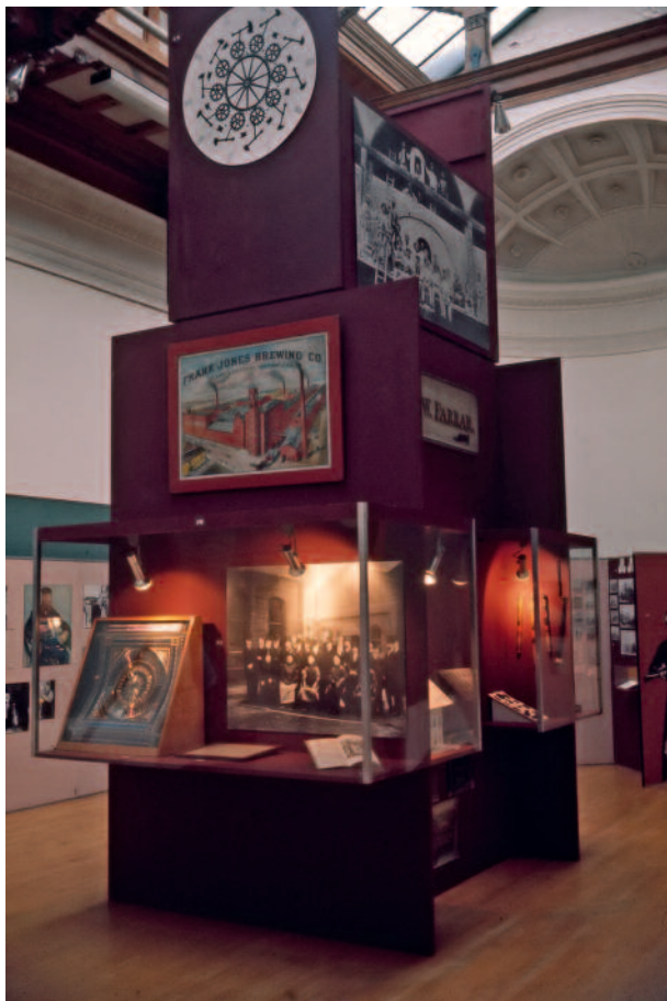
The WORK exhibition at the Glynn Vivian Art Gallery in Swansea.