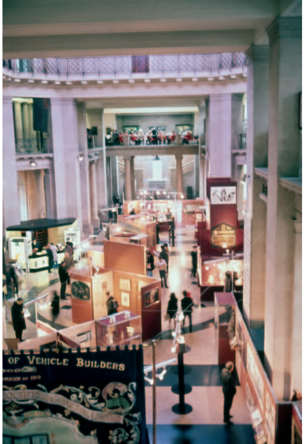
The WORK exhibition at the National Museum of Wales. A works band plays on the balcony.