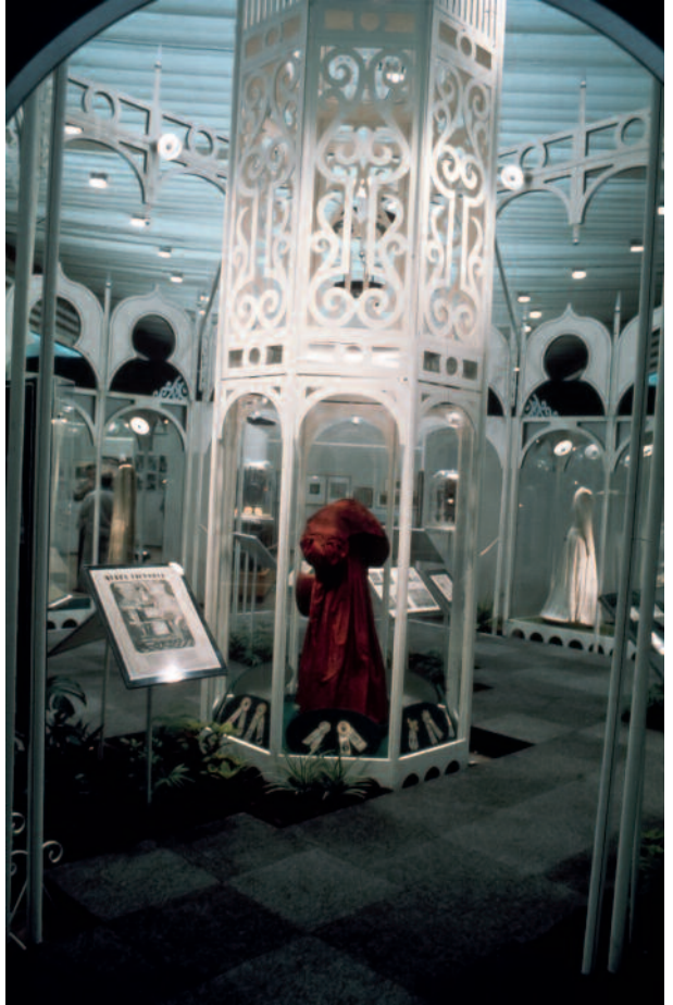
Part of the LOVE AND MARRIAGE exhibition.