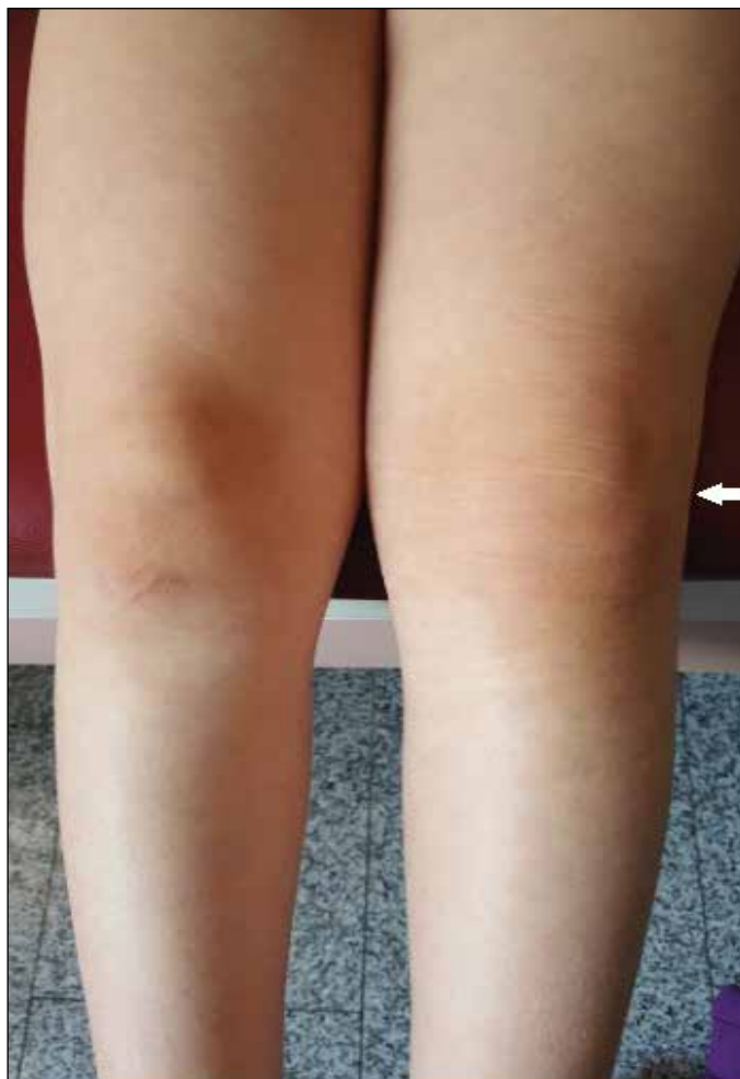
Figure 1. Left knee swelling (white arrow) at admission.

temperature of 39°C, a heart rate of 115 beats/minute, a respiratory rate of 22 breaths/minute, and a blood pressure of 115/80 mmHg. His left knee was swollen, warm to touch, and extremely tender upon palpation, with limited flexion and extension, owing to pain (Figure 1). There were no abnormalities in his other joints, eyes, skin, and genitourinary system.