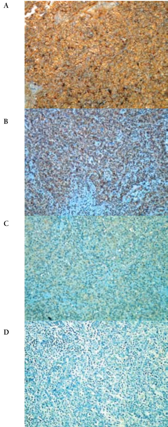
Figure 2. Representative immunohistochemical detection of GADD45 \gamma in diffuse large B-cell lymphoma (A-D). Diffuse large B-cell lymphoma comprising large neoplastic lymphoid cells with strong GADD45 \gamma staining intensity (Score: +++ (A), with moderate GADD45 \gamma staining intensity (Score: ++ (B), with weak GADD45 \gamma staining intensity (Score: + (C), and with no GADD45 \gamma staining (Score: 0 (D)) (original magnification 200 \times ).