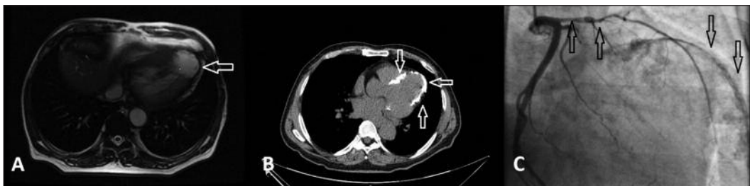
FIGURE 1: A) MRI image (aneurysmal sac), B) CT image, C) Coronary angiogram (LAD proximal lesion and calcification line).

A standard median sternotomy was performed under general anesthesia. A left internal mammary artery (LIMA) graft was prepared. After opening the pericardium and suspending it, the patient was heparinized. Arterial cannulation from the ascending aorta and two-stage venous cannulation from the right atrium were performed. After cannulation, cardiopulmonary bypass (CPB) was initiated at the appropriate activated clotting time. Using a cross-clamp, cardiac arrest was induced via isothermic hyperkalemic antegrade blood cardioplegia. A large calcified aneurysm was seen involving a large area of the LV apex (Figure 2A). A ventriculotomy was performed and sutured internally with a 4×3 cm Dacron patch. Then the opened aneurysm was closed externally using the Dor procedure with Teflon felt (Figure 2B, 2C). 2 Subsequently, an LIMA-LAD distal anastomosis was performed. The cross-clamp was removed, and the CPB was gradually ended with inotropic support. The patient was transferred to the intensive care unit and discharged without any problems on the seventh post-operative day.