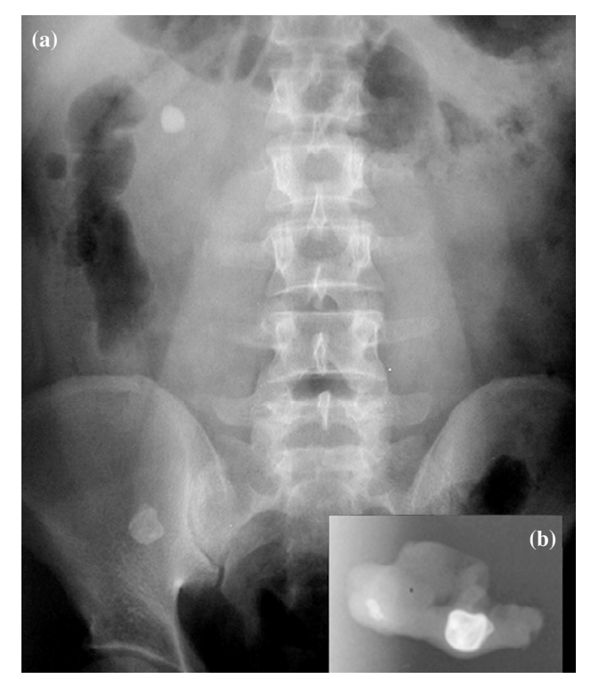
Fig. 1. (a) Plain film of the abdomen showing a stone in the upper pole of the right kidney and a radiopaque density, projected on the right iliac bone. (b) X-ray examination of the appendectomy material revealing an oval radiopaque structure with multilayered pattern of calcification.

A 38-year-old man presented unaccompanied to our emergency department with a history of intense, acute, recurrent, crampy right lower quadrant pain radiating to the right groin region, accompanied by nausea. The patient denied any anorexia, vomiting, fever, or urinary tract symptoms. The patient's medical history revealed that he had a right kidney stone about 1.5 cm in diameter and dysuria due to nephrolithiasis 10 years before. Physical examination of the abdomen revealed muscular defense and rebound tenderness in the right lower quadrant and tenderness in the line of the right ureter. Examination of the right flank revealed right costovertebral angle tenderness. There was no palpable mass in the abdomen. Bowel sounds were hypoactive. Digital rectal examination did not elicit any pain or tenderness. The patient's temperature was 38 °C and rectal temperature was 39.3 °C. Laboratory tests included a white blood count of 22.800 cells per mm3 with 93.6% neu-