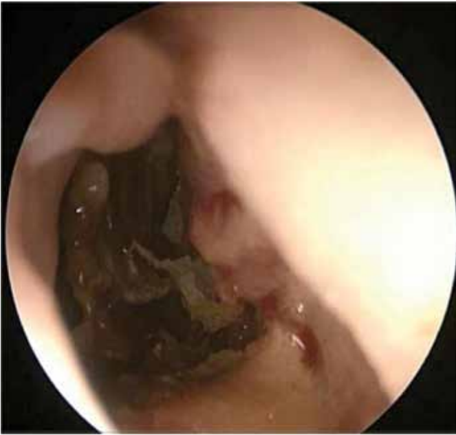
Figure 1. Partial perforation in septal cartilage.