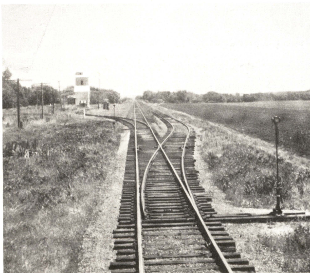
Railbed treated with a soil sterilant.

(List of Soil Sterilant Herbicides on back page)