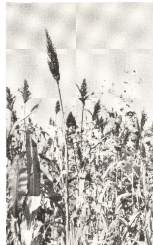
Figure 3—This infested area may have originated from a single seed.