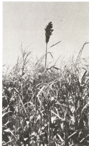
Figure 2—Wild cane can be eradicated at least cost when a lone plant is found in the field.