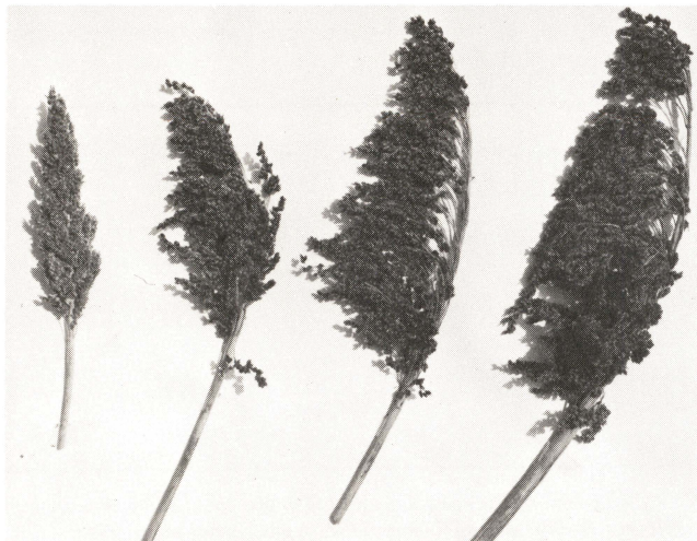
Figure 1—Note the wide variation in head type of wild cane. Heads have a pattern of side branching. A distinguishing characteristic at maturity is the hard shiny-black or dark reddish-brown seed.

Information contributed by L. E. Cavanah, Department of Agronomy, University of Missouri-Columbia, pertaining to dormancy of wild cane seed while over-wintering in the field demonstrates a progressive decline in germination percentage during the five-month period following harvest. Germination percent dropped from a high of 95% shortly after harvest to 49% five months later. During the same period, firm (hard) seed increased from 2% to 29%. Presumably, the hard seed was viable and would germinate under favorable conditions at a later date.