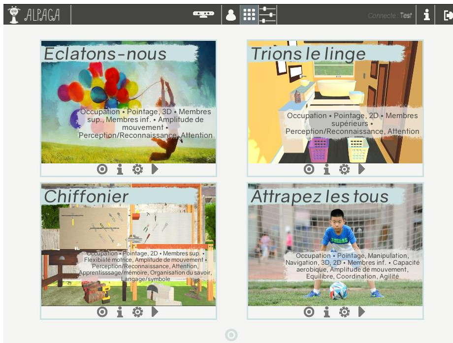
Fig. 3. Scene of Menus displaying the showcase of the proposed mini-games.

environment, categorization is based on perceptual color criteria. In the kitchen, the categorization is based on criteria for locating items to be stored in a tempered closet or in the refrigerator. The object-finder game is more about cognitive stimulation. It takes place in a handyman's workshop. An object is instantiated at the center of the screen. The patient must then find and touch the object in the scene. Another mode of the game proposed to search for a pair associated with the presented object. When the patient has pointed at an object in the virtual environment, another object is instantiated. This activity can be broken down into other scenes and categories of objects of everyday life. The ball game is inspired by soccer or handball. It is designed to stimulate lower limbs and balance skills. The scene is located by the sea, on a soccer field or in a meadow. In the center of the upper part of the screen is displayed a soccer goal, and a ball is instantiated at the bottom center of the screen. The patient must shoot in the ball to score a goal.